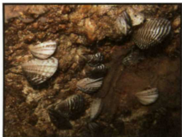
Quagga Mussels

Invasive mussels are spreading at an alarming rate across the United States. Zebra and quagga mussels are transported between bodies of water on boats, trailers, bait buckets and other equipment that comes in contact with the water.