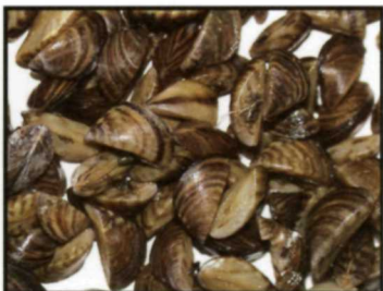
Zebra Mussels