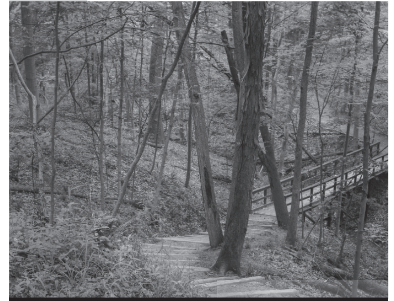
Pine Grove Trail.