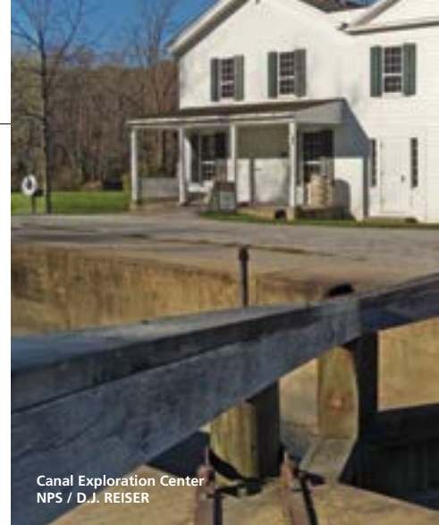
Canal Exploration Center

Questions? Call 330-657-2752. Email cuva_info@nps.gov . Click Plan Your Visit at nps.gov/cuva .