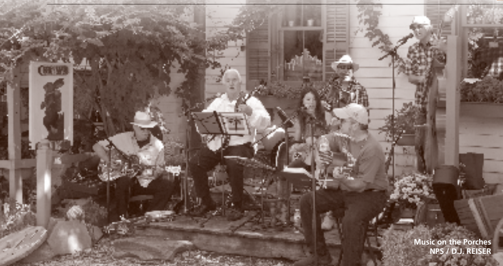
Music on the Porches

leisurely 1.5-mile hike on an unpaved, flat trail. Oak Hill Trailhead, 2 - 3:30 p.m.