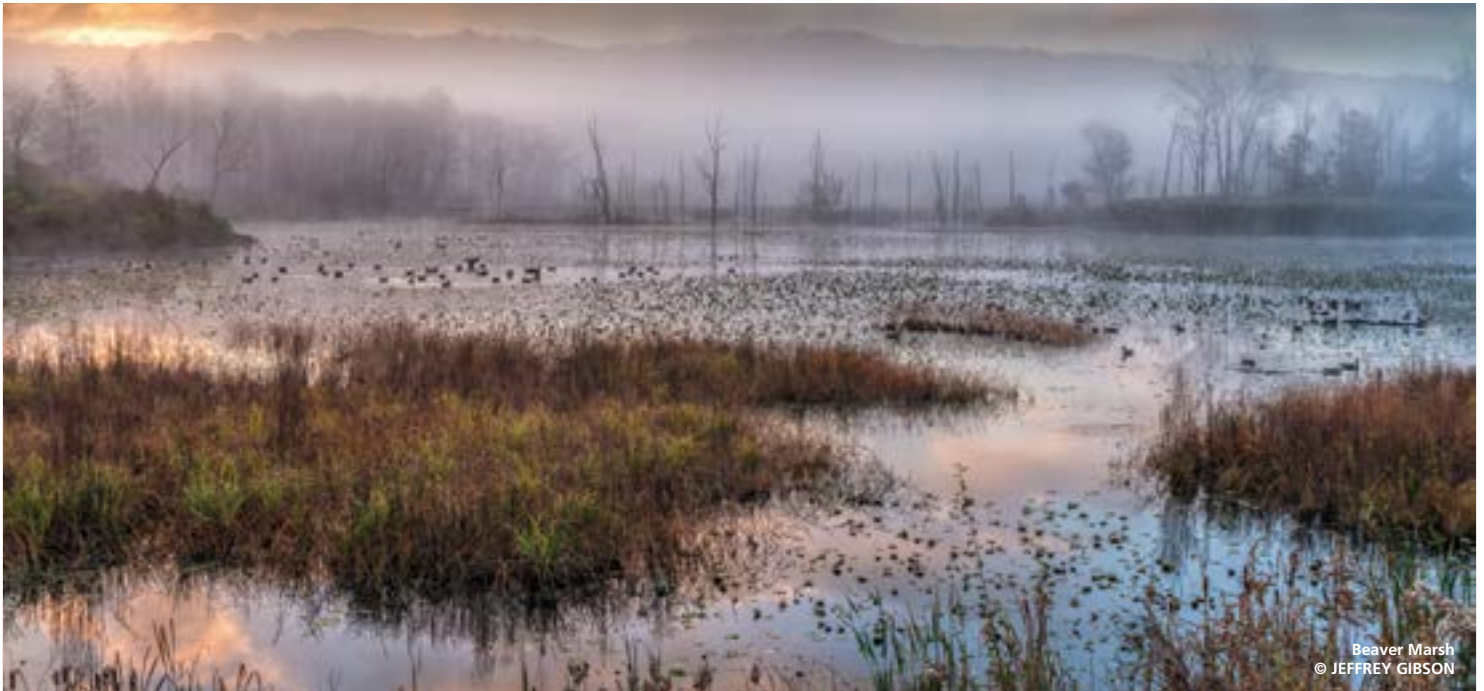
Beaver Marsh

Akron Northside Station - 27 Ridge Street, off Howard Street, Akron 44304