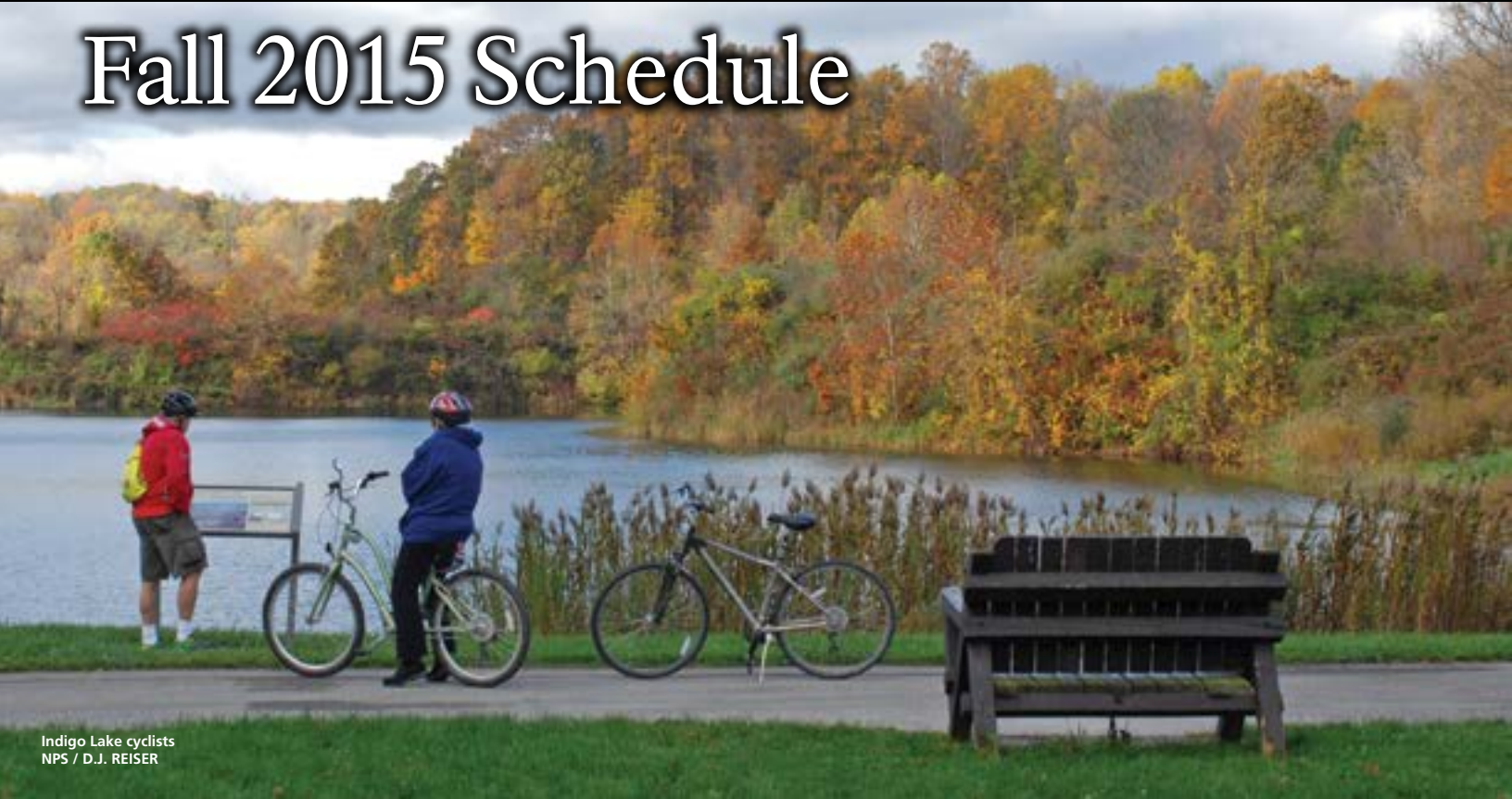
Indigo Lake cyclists