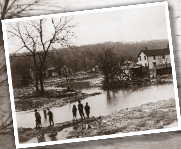
Flooding in Boston (inset) and Peninsula, 1913.