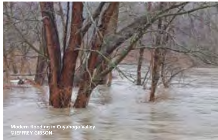
Modern flooding in Cuyahoga Valley.

See page 18 for the description of this hike from Lock 4 to Lock 1 in downtown Akron. Lock 3, 11:30 a.m.