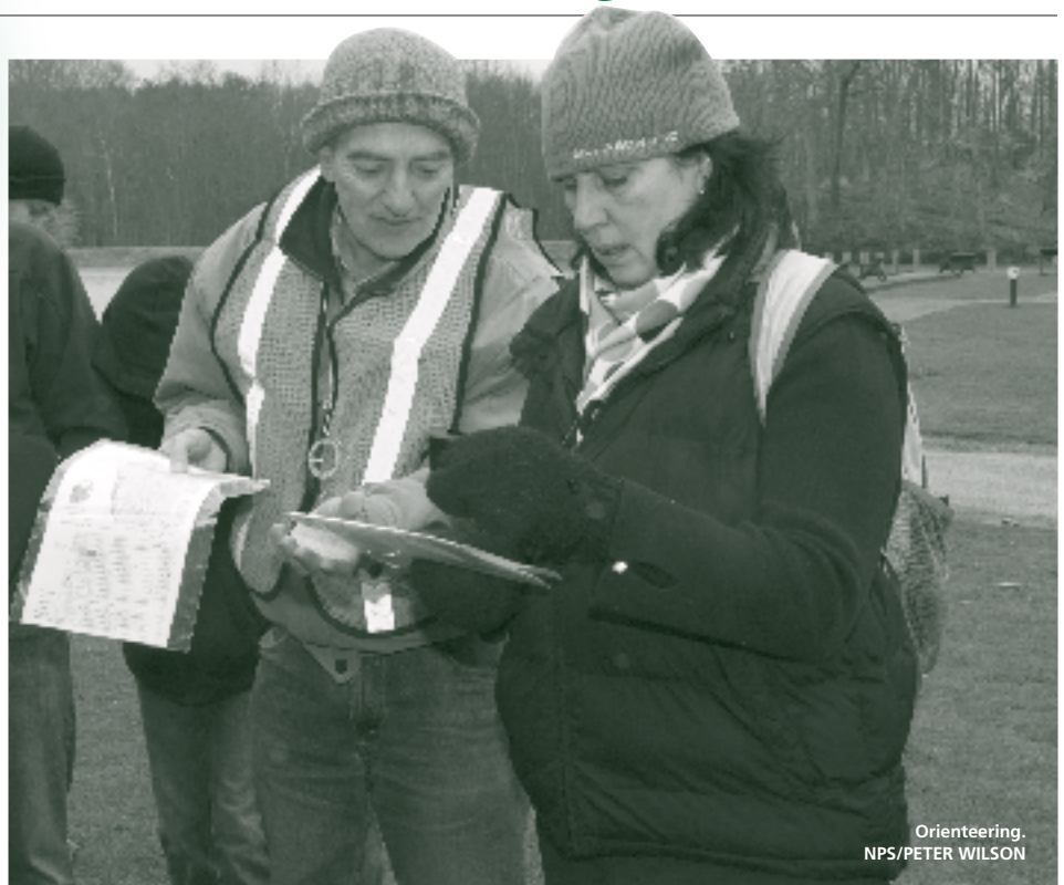
Orienteering.

This spring Hunt House will be open on Saturdays and Sundays (plus Monday, May 26), from 10 a.m. - 4 p.m. Stop by to enjoy kid-friendly exhibits, chat with our friendly volunteers, or take a break on the lawn. Although it now has a simpler name, this drop-in facility continues to serve visitors along the Towpath Trail.