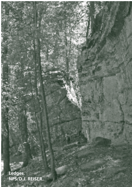
Ledges.