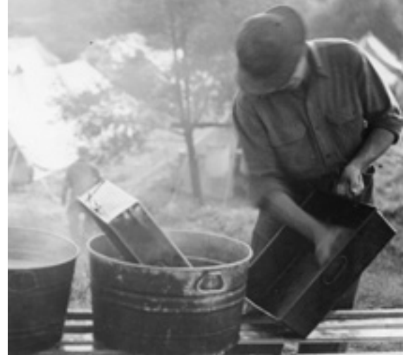
CCC camp at Furnace Run.

This series is presented in partnership with the Conservancy for Cuyahoga Valley National Park.