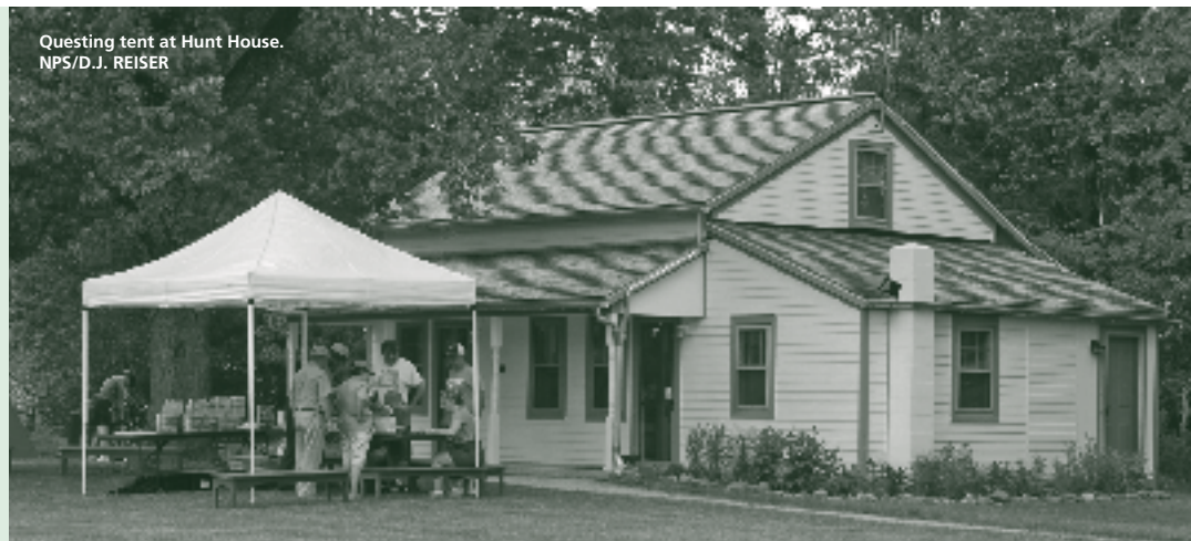
Questing tent at Hunt House.

Join park rangers and volunteers for a camping version of the drop-in open house—the OPEN TENT! Stop by to chat about park camping, Leave No Trace principles, and equipment options. You can also learn a skill or two. Hunt House, 1 - 3 p.m.