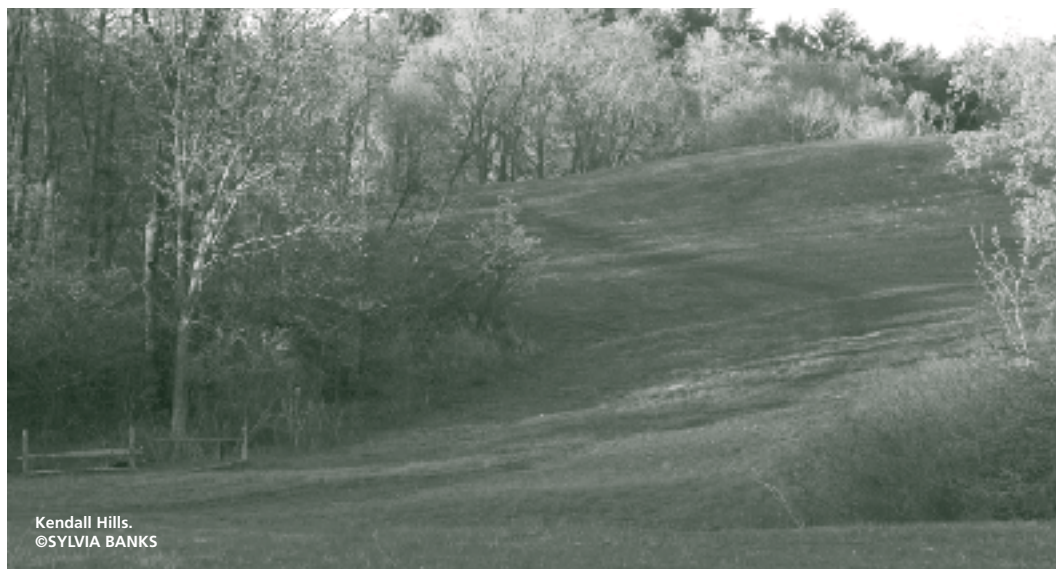
Kendall Hills.

6 miles along the hilly, unpaved Lake, Cross Country, and Salt Run trails. Kendall Lake Shelter, 9 a.m. - noon.