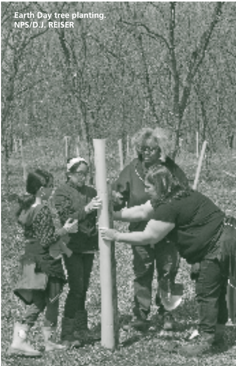
Earth Day tree planting.