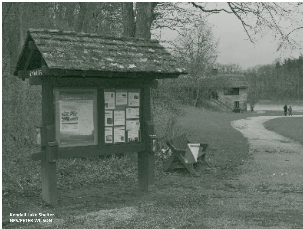
Kendall Lake Shelter.

This follow-up hike takes us 4 hilly miles along Haskell Run. During the journey, the stream winds in and out of view. Pine Lane Trailhead, 9 - 11 a.m.