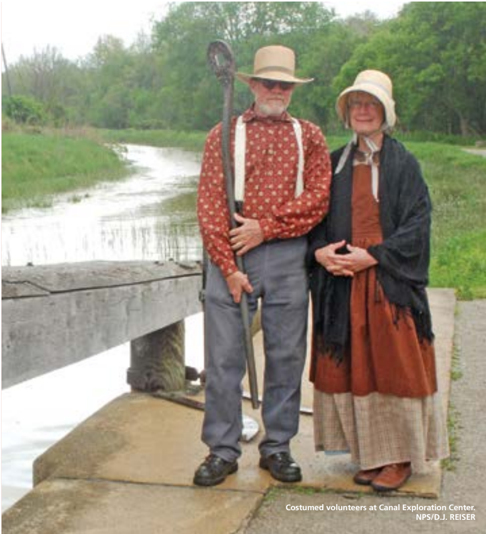
Costumed volunteers at Canal Exploration Center.

Akron Art Museum - 1 South High Street, Akron 44308