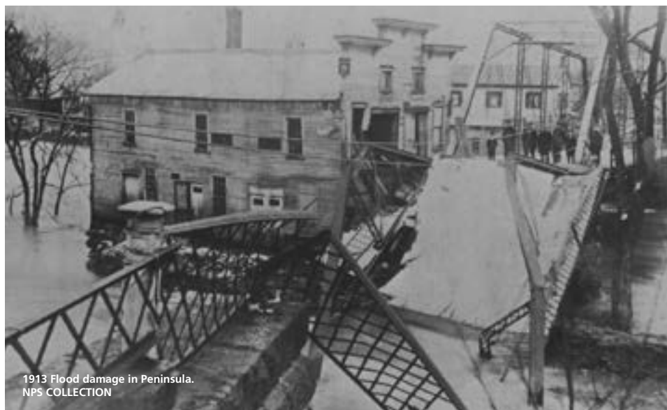
1913 Flood damage in Peninsula.