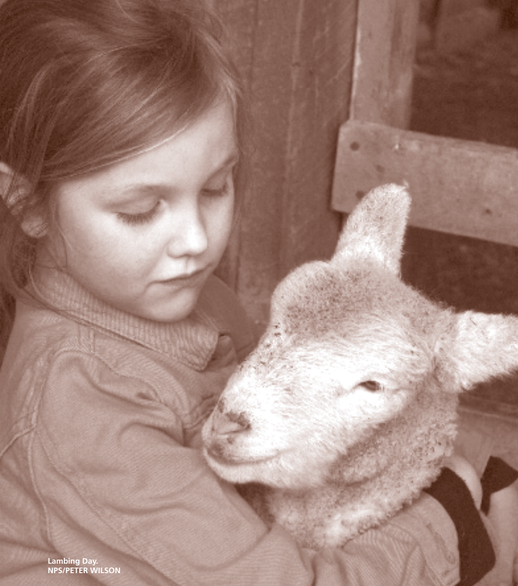
Lambing Day.