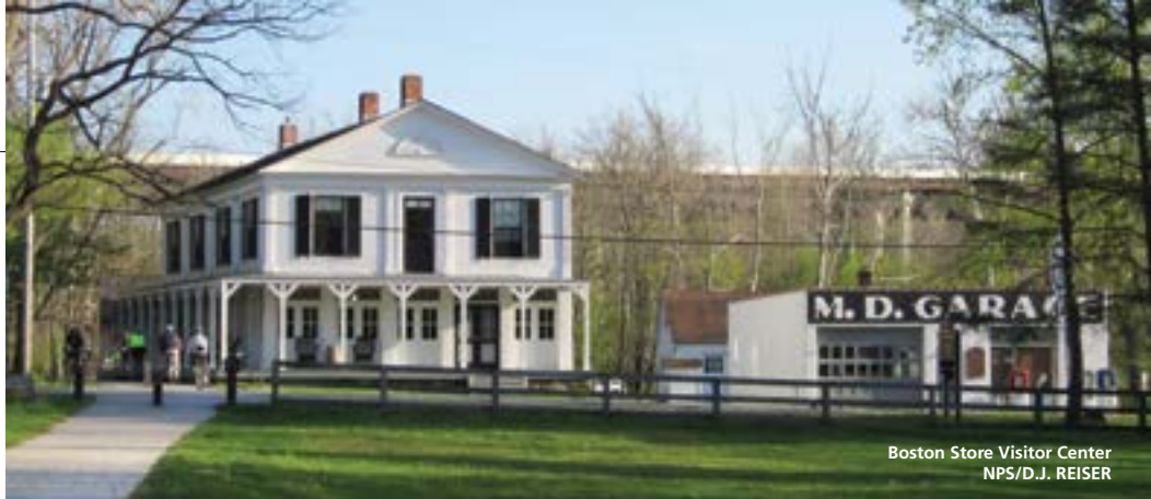
Boston Store Visitor Center