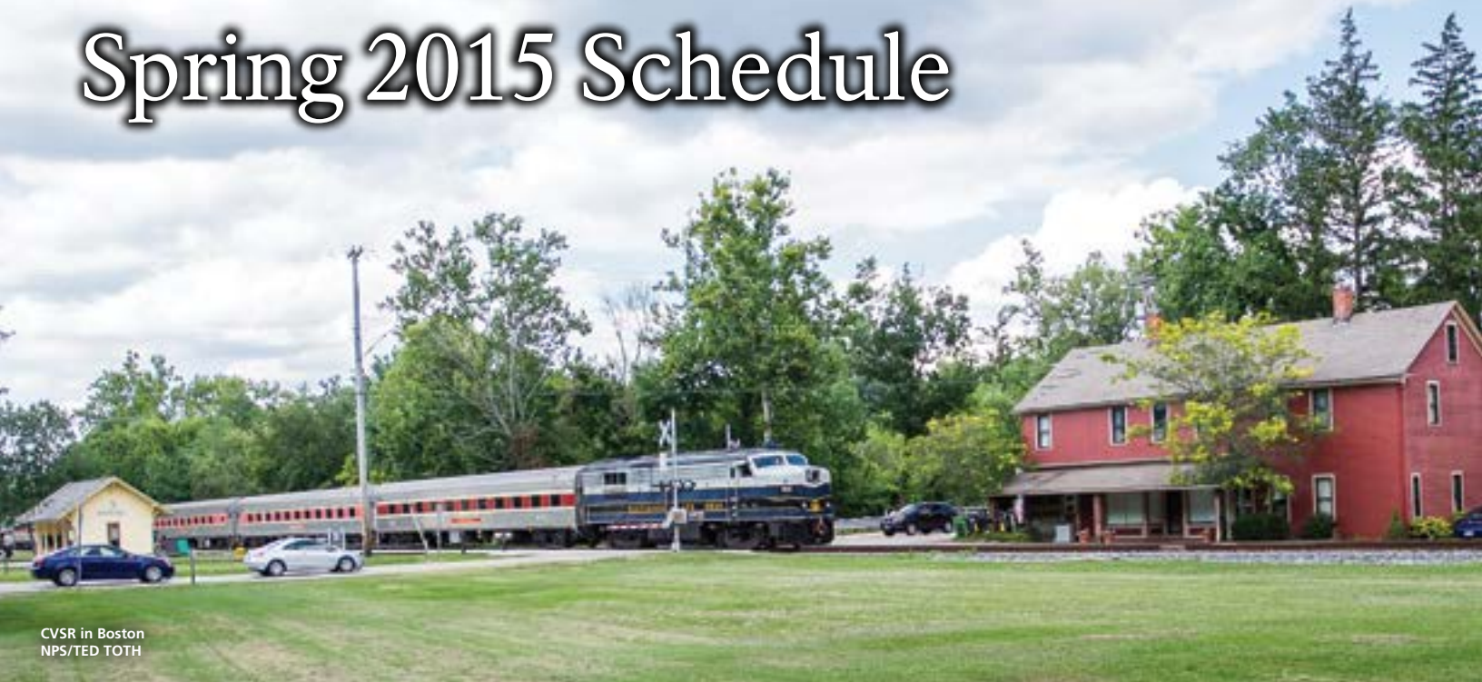
CVSR in Boston