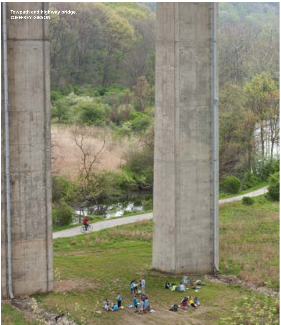
Towpath and highway bridge.

Like Cuyahoga Valley National Park on Facebook!