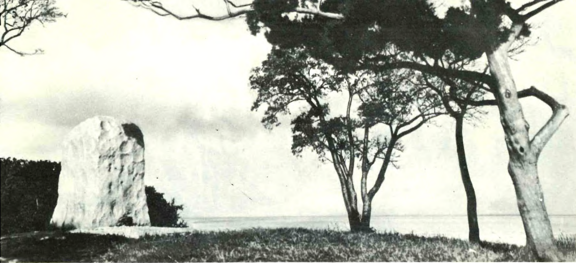
View from Shaw's Point across the mouth of Manatee River to Tampa Bay. The De Soto Trail marker atop the Indian mound was unveiled under auspices of the National Society of Colonial Dames of America on May 30, 1939, the 400th anniversary of De Soto's landing

Running a gauntlet of arrows, the ships found the gulf 19 days later. On September 10, some 300 Spaniards and 100 Indians reached Mexico's Pánuco River. There, haggard and worn, they found a warm welcome.