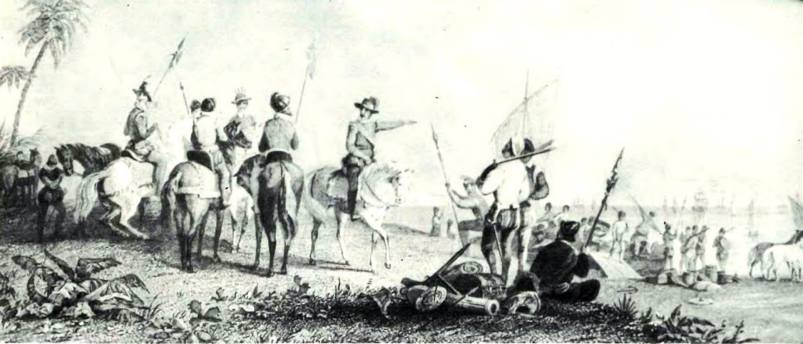
The Landing in Florida. From Smith's Narratives.