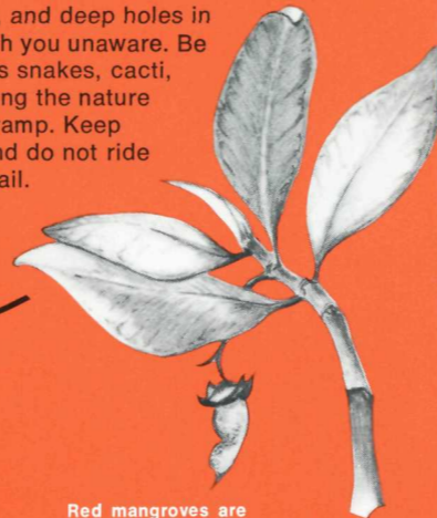
Red mangroves are land makers. Their roots trap drifting plantlife and soil particles thereby inching the land forward into the shallow water.

Do not be lured by the natural setting into doing something foolish, for inherent dangers are here. Sharp shells and barnacles can cut your feet while wading, and deep holes in the river may catch you unaware. Be alert for poisonous snakes, cacti, and poison ivy along the nature trail and in the swamp. Keep pets on a leash and do not ride bicycles on the trail.