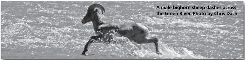
A male bighorn sheep dashes across the Green River.

A current copy of the 2015 Information and Regulations booklet, an accurate passenger list that matches the one on file in the river office, and a permit for launch signed by the river office are required to be readily available at all times.