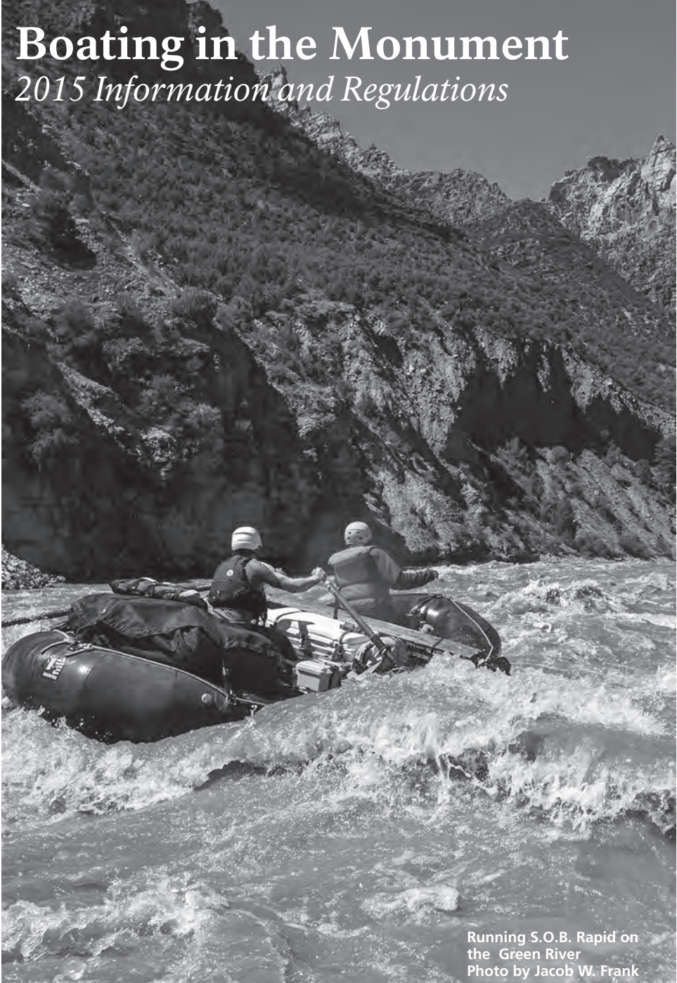
Running S.O.B. Rapid on the Green River