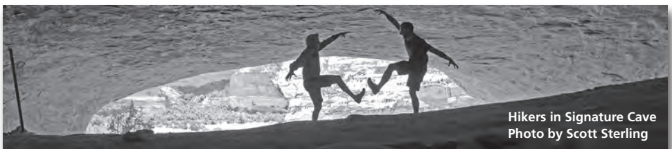
Hikers in Signature Cave

Boating under the influence of alcohol or a controlled substance is prohibited. All underage drinking is prohibited.