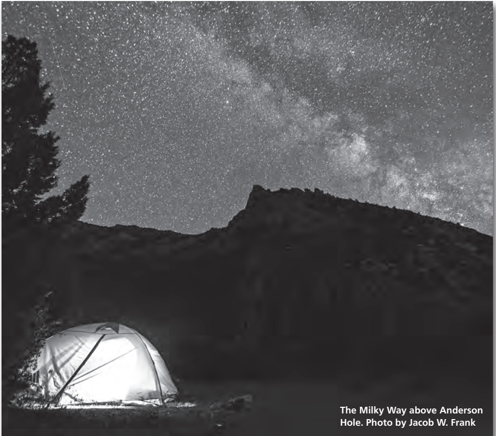
The Milky Way above Anderson Hole.

Any incidents resulting in injury, death, or disappearance of any participant or property damage greater than $2000 must be reported to Dinosaur National Monument within 24 hours or as soon as practical.