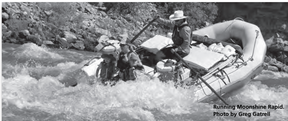
Running Moonshine Rapid.