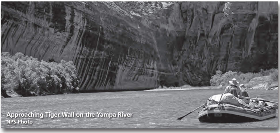
Approaching Tiger Wall on the Yampa River

Do not leave trash in your vehicle at the put-in or the take out, or in the vault toilets. This can habituate local wildlife, including chipmunks, squirrels, mice, skunks, and bears to human food.