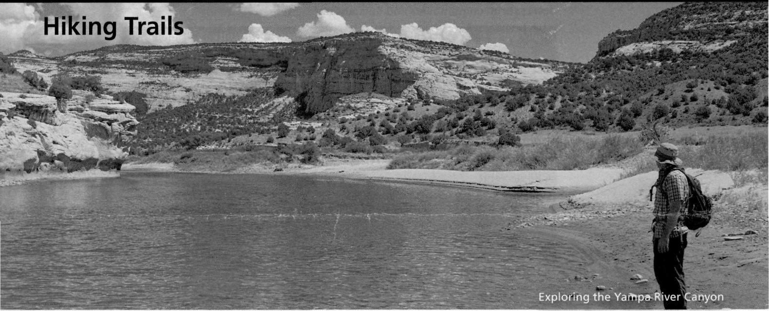
Exploring the Yampa River Canyon

Hiking is a great way to experience the monument's intriguing history and rugged scenery. Before you begin any hike, be prepared for changing conditions in the desert environment. Most trails are exposed to full sun. In the summer, bring at least one liter of water per person for each hour hiking. Sturdy hiking shoes are recommended on all trails. Elevations vary across Dinosaur National Monument, ranging from 4,700 feet at river level near the Quarry Visitor Center to over 8,000 feet.