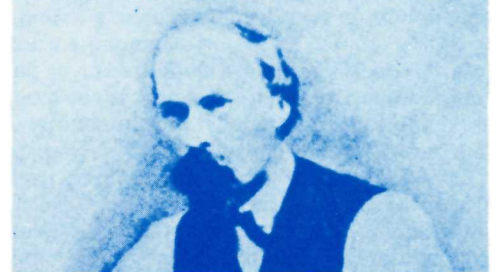
Dr. Samuel A. Mudd

physician was convicted of conspiracy and sentenced to life imprisonment at hard labor.