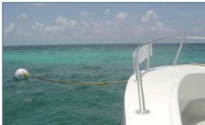
Mooring buoys provide an alternative to substrate-damaging boat anchors.

Dive Site Mooring Buoy Survey. A survey will be conducted to identify potential diving and snorkeling sites for designation throughout the RNA. These sites will require mooring buoys because anchoring will not be permitted in the RNA. Ideally, these buoys will be located in areas that do not include sensitive resources, such as federally-endangered coral species, but that represent the range of habitats found in the RNA. Buoys also will be located close to other areas of interest to visitors, such as shipwrecks.