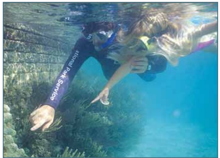
A visitor discovers coral colonies growing at the base of historic Fort Jefferson in Dry Tortugas National Park.

Crowding and Conflicts. Changing patterns of visitor use may have both positive and negative ecological effects on the park's natural and cultural resources, as well as on the quality of visitor experiences. The Visitor Experience and Resource Protection (VERP) plan will link natural resource data with social science tools to provide park managers with clear guidance for managing visitor use. Two methods will be used: (1) a photographic simulation that examines visitors' preferences for various management alternatives, and (2) a simulation model that identifies the maximum number of daily visitors that the park can sustain without violating crowding and conflict standards. Results will help to ensure long-term resource protection and high-quality visitor experiences.