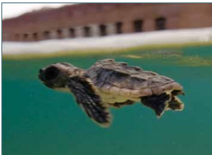
Loggerhead ( Caretta caretta ) sea turtle hatchling near Fort Jefferson in Dry Tortugas National Park.

Monitoring of sea turtle nesting, hatching success, and stranding is conducted in collaboration with the FFWCC, National Marine Fisheries Service (NMFS), and U.S. Fish and Wildlife Service (FWS). These three agencies are training NPS personnel to use methods that are compatible with those being used elsewhere in Florida, so that data and findings can be shared.