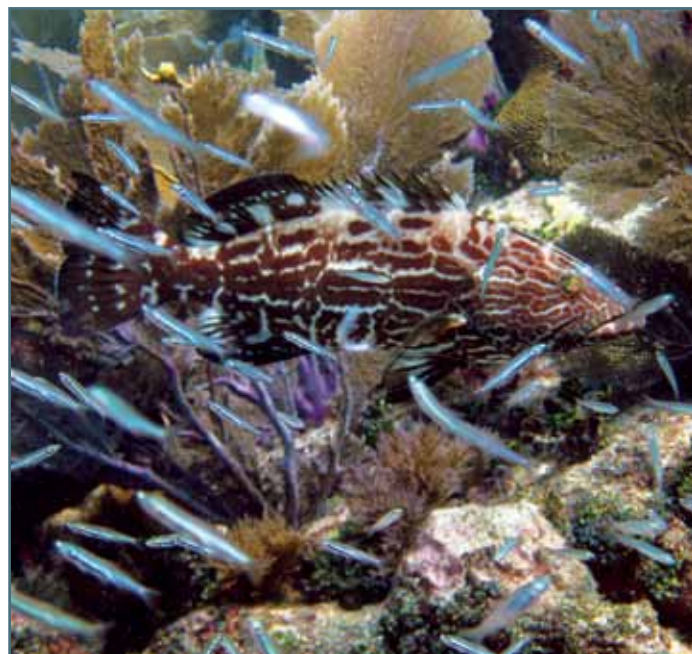
Black Grouper ( Mycteroperca bonaci ), an important reef gamefish.

Permitting System. Permits will be required for all activities conducted in the RNA, including research and recreational snorkeling and diving, and may also be required for activities located within the RNA on Loggerhead Key. Permits also will be required for mooring buoy reservations. Initially, these permits will only be issued in person at Garden Key, but the ultimate goal is to make them available via the Internet, telephone, and mail. Eventually, permits will be available through Dry Tortugas and Everglades National Parks and the Florida Keys EcoDiscovery Center in Key West. Fees may be implemented to help cover the costs of the permit program. An education program will be developed that includes a fact sheet and personal interaction with park staff to educate visitors and researchers about the permitting process.