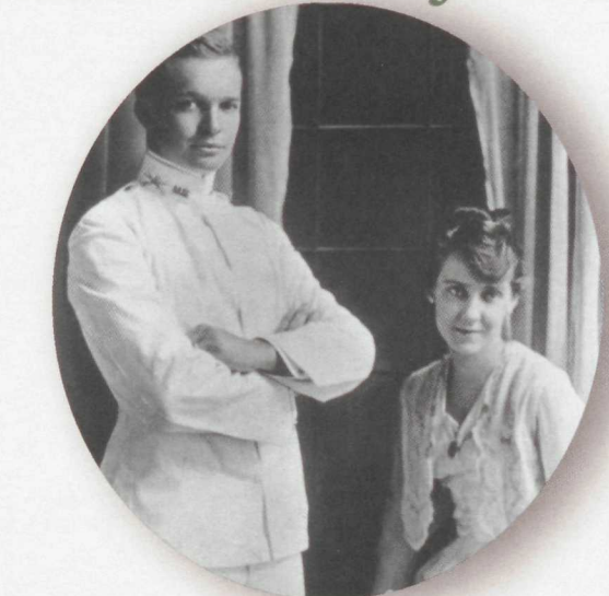
Dwight and Mamie married on July 1, 1916, in a simple ceremony at the Doud home in Denver.

1942 Named Asst. Chief of Staff in charge of War Plans; is named Asst. Chief of Staff of new Operations Division; is appointed Commander of European Theatre of Opera-