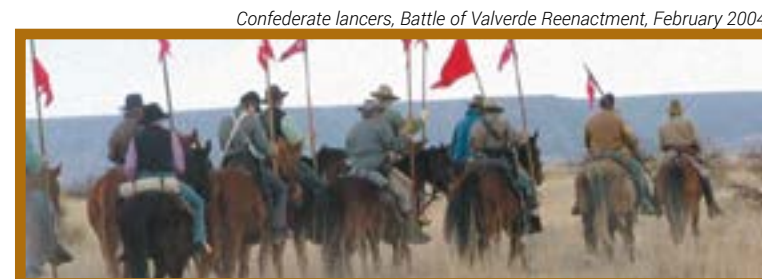
Confederate lancers, Battle of Valverde Reenactment, February 2004

Fort Craig's new massive gravel bastions were 'reinforced' with Quaker Guns (fake wooden cannons) and empty soldiers' caps alongside real cannons and caps with real Union soldiers under them. This impressive show squelched any Confederate plans for a direct assault. After days of unsuccessfully trying to lure Union forces from their heavily protected fort, Confederates moved north in an attempt to maneuver around Fort Craig and cut off Union supplies. With the Confederates on the move, Canby started north to ensure Fort Craig was not left isolated and vulnerable.