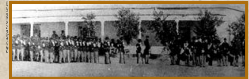
Fort Craig circa 1865–1868: U.S. soldiers in front of the enlisted men's quarters.

The transition from Spanish to Mexican rule in 1821 didn't bring many changes. When U.S. General Stephen Watts Kearney invaded in 1846 with his Army of the West, he promised that the U.S. would put an end to Indian raids. The U.S. established a network of forts in the new U.S. Territory of New Mexico, including a garrison at Socorro in 1849. The Socorro Garrison was replaced by Fort Conrad in 1851 and ultimately Fort Craig, in 1854.