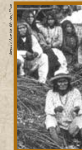
Apache prisoners, 1886. Lozen is in the top row, second from left; next is Dahteste and Geronimo is at the lower right.

Lozen, the great Warm Springs Apache woman warrior, is not as well-known as the male warriors, but to the Apache she is possibly more revered. Her brother, Chief Victorio, said "Lozen is my right hand....strong as a man, braver than most, and cunning in strategy. Lozen is a shield to her people." Her people relied on her supernatural powers to know the location of the enemy, and to heal the wounded. Lozen and Dahteste, another woman warrior, helped negotiate the final surrender. It took an army of 5000 soldiers, as well as the Apache Scouts, to secure the surrender of this last Apache group, which consisted of about 17 men and 19 women and children. Lozen died of tuberculosis after 5 years in captivity at Mount Vernon Barracks, Alabama. Dahteste survived the 27 years of captivity and lived out her remaining years on the Mescalero Reservation.