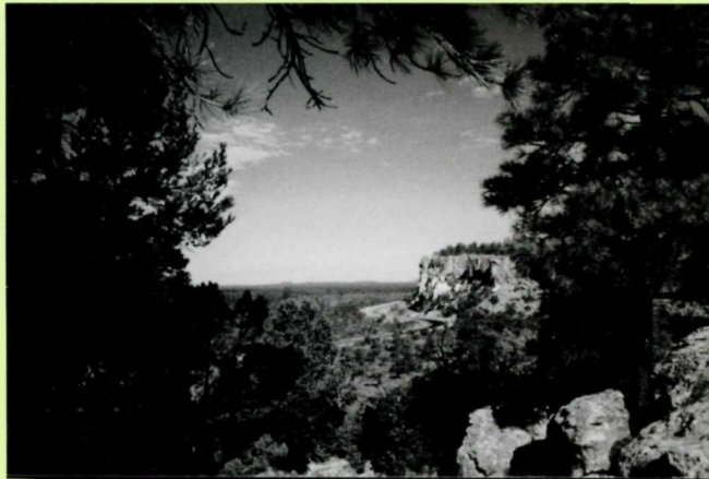
The views from the narrows rim are spectacular to say the least. Going to the far end, a distance of 3 miles, will result in excellent vistas.

Narrows Rim Trail gives hikers the opportunity to witness geologic processes, thousands of years apart. Stroll along the ancient mesa top and view the much younger lava flows below. This remarkable scenery of the lava beds and surrounding countryside ends with a picturesque view of La Ventana Natural Arch.