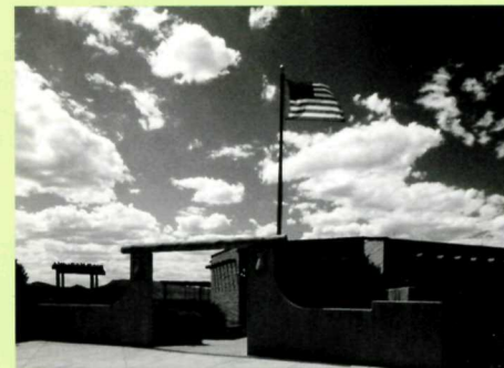
El Malpais Ranger Station is open seven days a week from 8:30 a.m.-4:30 p.m.

Check in with the Ranger Station, (9 miles south of I-40 on NM 117) for more information on this hike as well as other great hiking opportunities within El Malpais.