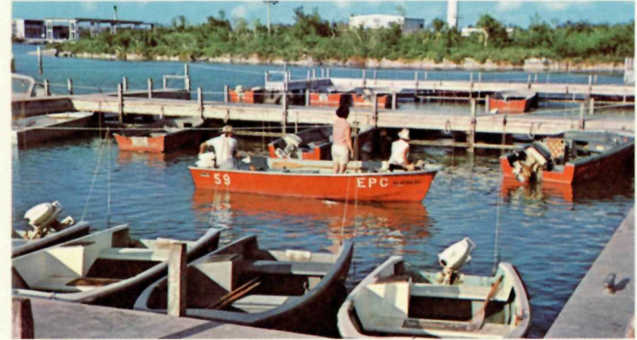
Rental Fishing Boats, Flamingo Marina