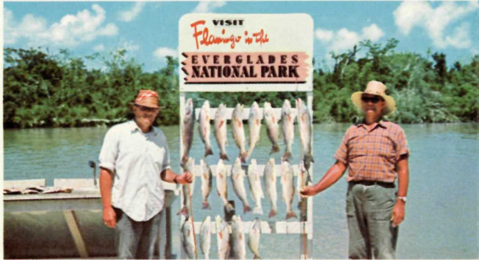
Excellent fishing at Flamingo