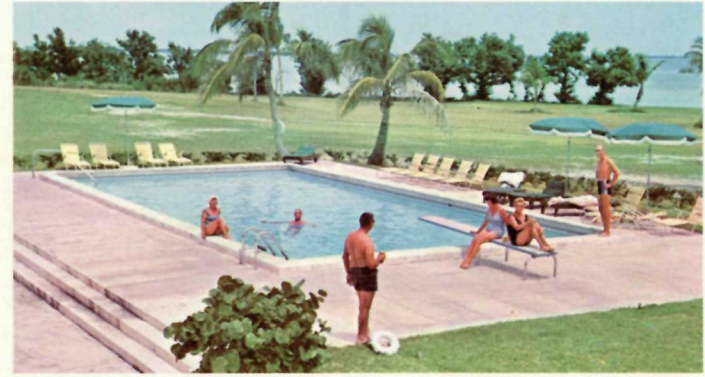
Pool at Flamingo Lodge