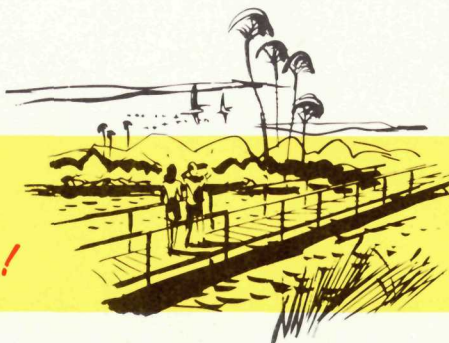
Photo supplies are on sale at the souvenir and gift shop. The unusual wildlife and natural beauty of the country provide countless subjects for never-to-be-forgotten pictures. You will be kept busy snapping your camera at every turn, while the artist will be unable to resist the urge to capture on canvas something of the mystery and wonder of the Everglades Wilderness.

FISHING AND BOATING ARE TOPS. The waters surrounding Flamingo form one of the few unspoiled saltwater fishing areas left in Florida. Everything an angler might ask for is to be found at the Marina: bait, tackle, marine gas and oil, a boat