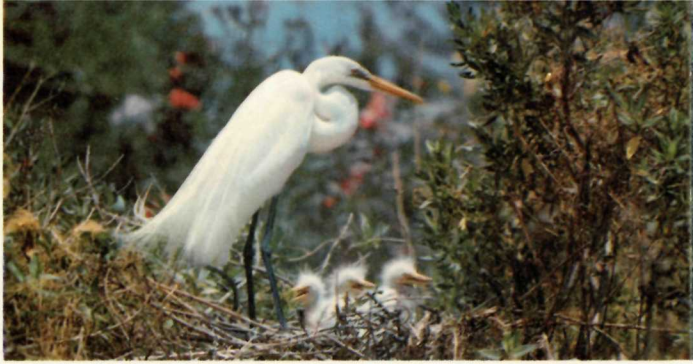
American Egret and young

Charter fishing boats with native guides are available. All boats fully equipped for all day or half day fishing accommodating up to six persons.