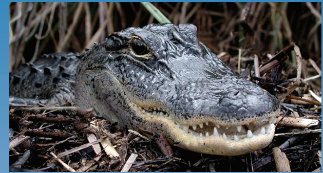
American alligator

The center serves Everglades and Dry Tortugas National Parks by providing the best scientific information available to answer natural resources management questions. Center scientists draw on inventory