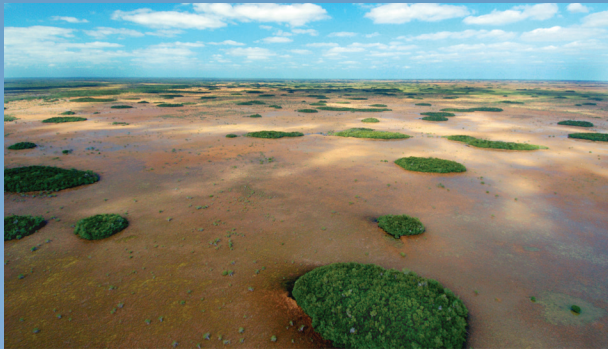
Tree islands located west of Taylor Slough

The Hole-in-the-Donut project is a cooperative effort between ENP and Miami-Dade County to restore an area of the park that is dominated by non-native plants back to a marl prairie wetland community. The