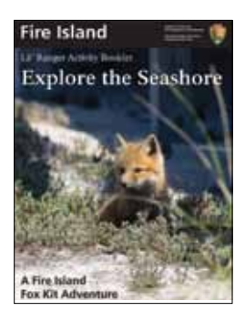
Our newest booklet is "Explore the Seashore" The Lil' Rangers series is for those 5-7 years old.