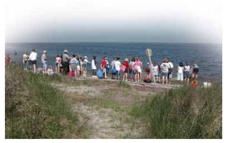
Junior Rangers sample nekton in the Great South Bay through seining.