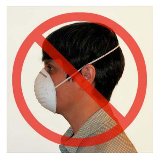
Figure 5 A one-strap paper mask is not a respirator and would provide little or no protection from smoke particles.

cannot provide the protection that respirators do. Commonly available one-strap paper dust masks, which are designed to keep larger particles out of the nose and mouth, typically offer little protection. The same is true for bandanas (wet or dry) and tissues held over the mouth and nose. Surgical masks are designed to filter air coming out of the wearer's mouth, and do not provide a good seal to prevent inhalation of small particles found in wildfire smoke. Incorrect use of respirators, or use of other, less protective face coverings, may give the wearer a false sense of security and encourage increased physical activity and time spent outdoors, resulting in increased exposures.