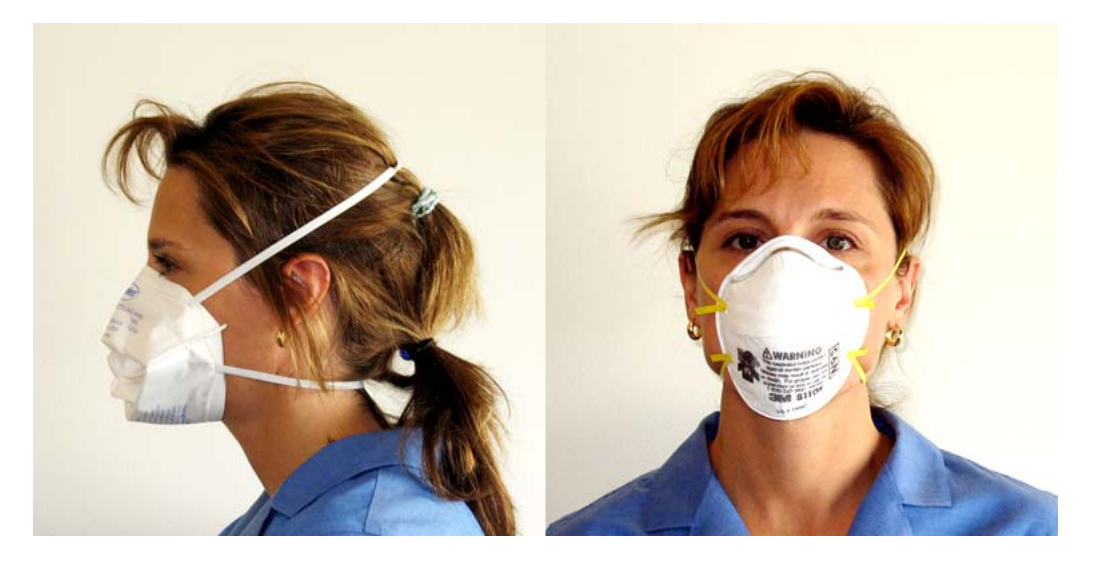
Figure 4 Two types of recommended N95 Disposable Particulate Respirators. Note the presence and placement of the two straps above and below the ears.

Filtering facepiece respirators are a type of respiratory protection in which the entire respirator is comprised of filter material. The most common types are called N95 (used in health care settings to protect against inhalation of infectious particles) and P100 (used to protect against toxic dusts such as lead or asbestos). Filter material rated "95" will capture at least 95% of very small particles, while material rated "100" filters out at least 99.97%. These respirators must be certified by the National Institute for Occupational Safety and Health (NIOSH), with the words "NIOSH" and the designation "N95" or "P100" appearing on the filter material. P100 respirators are more expensive than N95 respirators and will have somewhat higher resistance to airflow. The cost difference may make people reluctant to change them out when necessary, so N95 respirators may be preferable in wildfire smoke situations. Leakage around the respirator will result in more particles inhaled by someone wearing a respirator than passage through the filter material. Therefore, in practice, particularly without formal fit testing, N95s and P100s will provide similar levels of protection against wildfire smoke.