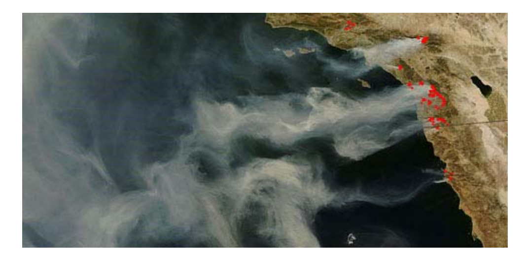
Figure 1 Discrete smoke plumes early in fire's evolution