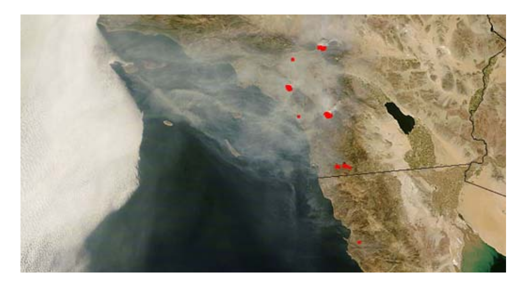
Figure 2 Less dense but more widespread smoke after days of air movement

Terrain affects weather, as well as fire and smoke behavior, in several ways. For example, as the sun warms mountain slopes, air is heated and moves upslope, bringing smoke and fire with it. After sunlight passes from a slope, the terrain cools and the air begins to descend. This creates a down-slope airflow that can alter the smoke dispersal pattern seen during the day.