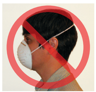
A one-strap paper mask will NOT protect your lungs from wildfire smoke.