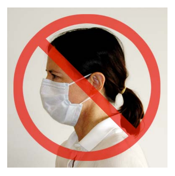
Figure 6 A surgical mask, which is designed to capture infectious particles generated by the wearer, is not a respirator and would provide little or no protection from smoke particles.