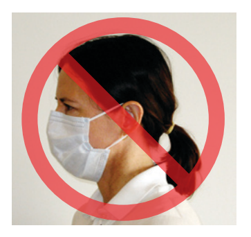
A surgical mask will NOT protect your lungs from wildfire smoke.

Wildfire smoke can irritate your eyes, nose, throat and lungs. It can make you cough and wheeze, and can make it hard to breathe. If you have asthma or another lung disease, or heart disease, inhaling wildfire smoke can be especially harmful.