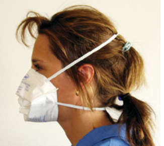
N95 respirators can help protect your lungs from wildfire smoke. Straps must go above and below the ears.