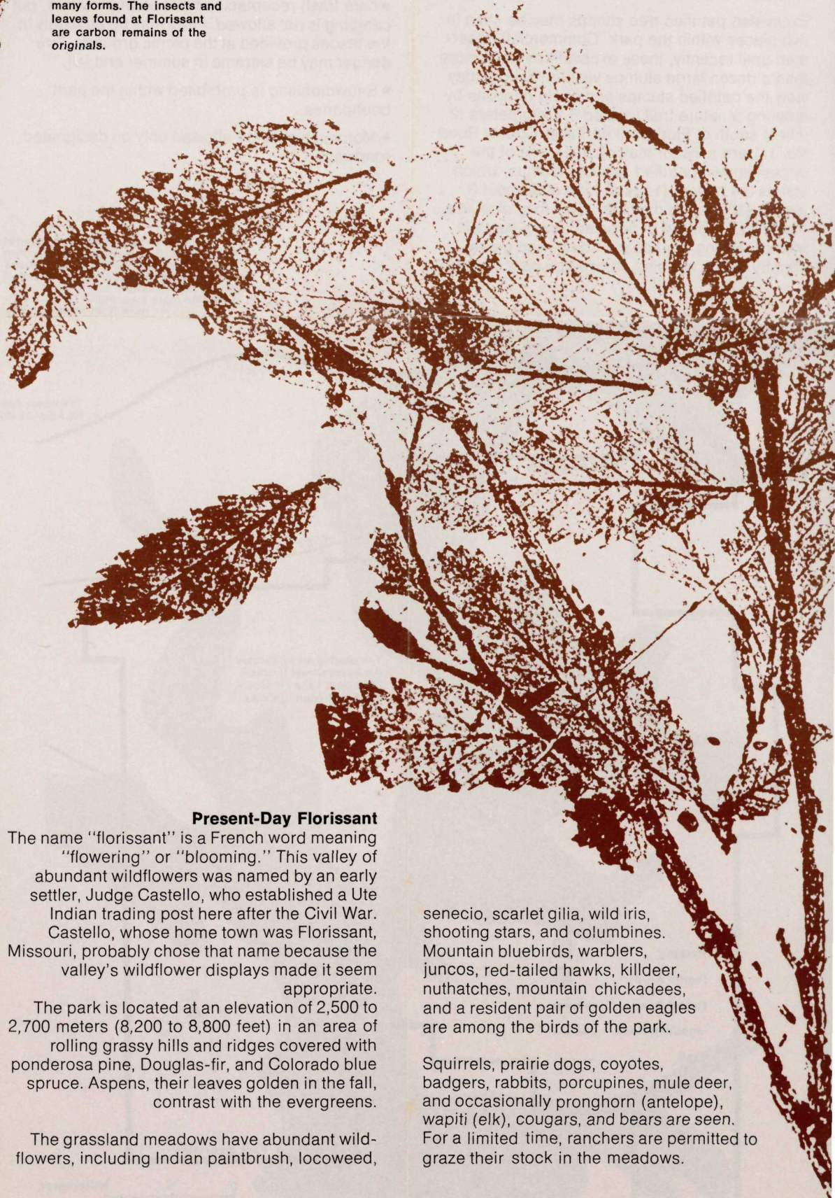
Florissant is a classic locality known to many scientists. Historically significant to the geologist, the paleontologist, the entomologist, and the botanist, it is the home source for the numerous fossil insects and leaves that grace the exhibition halls and research rooms of many institutions of learning.