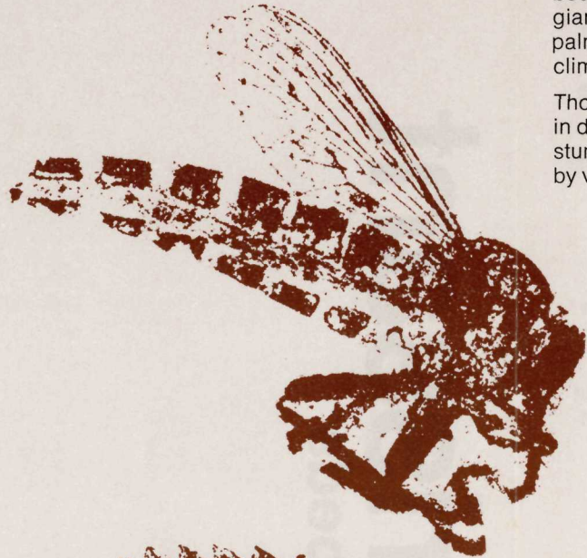
Fossils, nature's vivid reminders of long-past life, take many forms. The insects and leaves found at Florissant are carbon remains of the originals.

Though the fossil impressions can be seen only in displays at the visitor center, giant petrified tree stumps have been excavated and can be viewed by visitors touring the park.