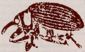
The rare quality of Florissant lies in the delicacy with which thousands of fragile insects, tree foliage, and other forms of life—completely absent or extremely rare in most paleontological sites—have been preserved in stone.

During the same period of volcanic activity, mudflows buried forests that grew around the lake and petrified them in place. Eventually the lake itself was filled and overrun by these volcanic products. Thus the fossil-rich lake shales were preserved for millions of years beneath a hard volcanic cover. More recent erosion has segmented this volcanic cover, exposing the lakebed in its present position.