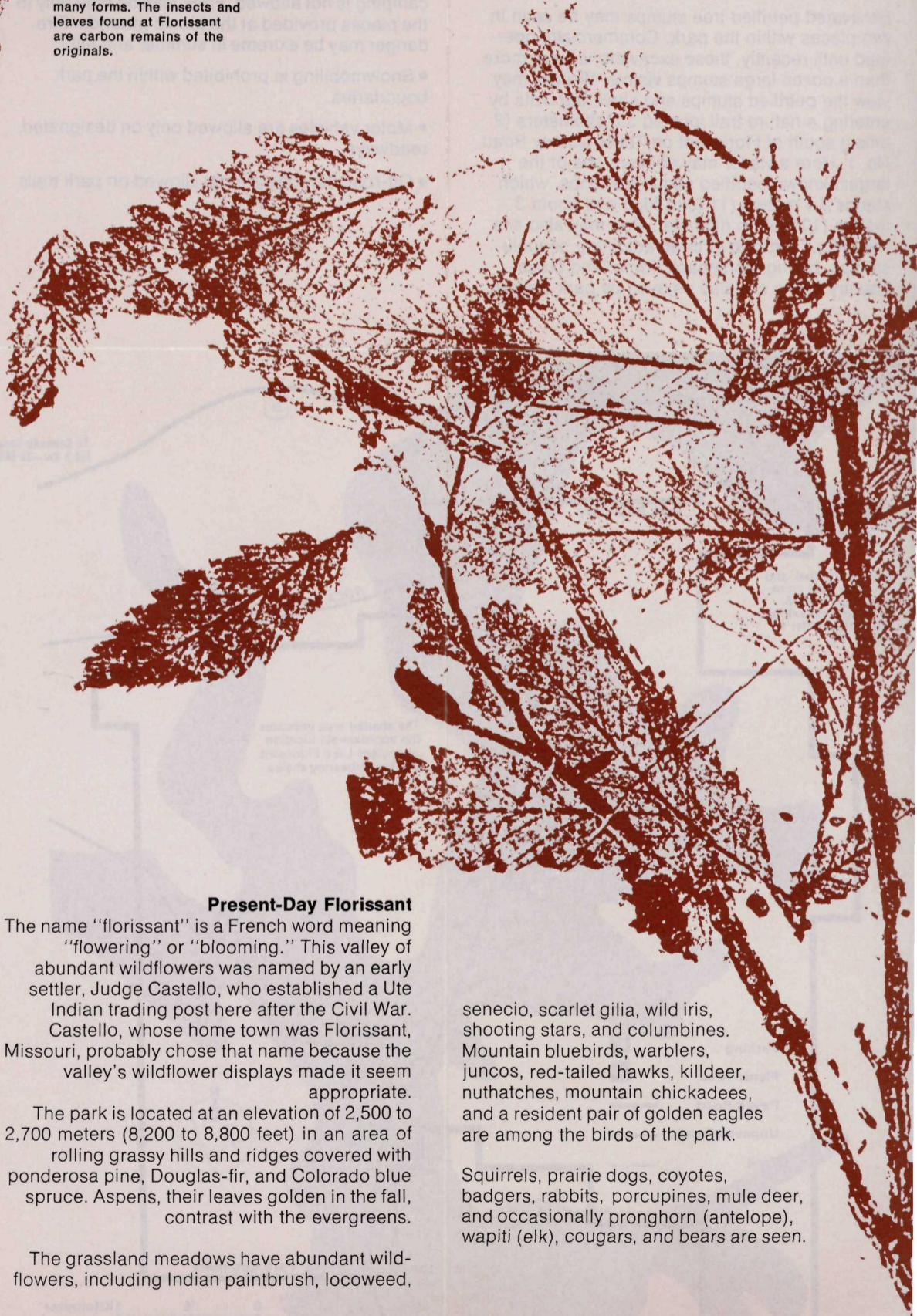
Florissant is a classic locality known to many scientists. Historically significant to the geologist, the paleontologist, the entomologist, and the botanist, it is the home source for the numerous fossil insects and leaves that grace the exhibition halls and research rooms of many institutions of learning.