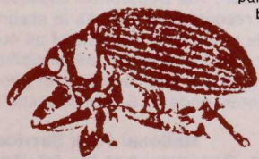
The rare quality of Florissant lies in the delicacy with which thousands of fragile insects, tree foliage, and other forms of life—completely absent or extremely rare in most paleontological sites—have been preserved in stone.

During the same period of volcanic activity, mudflows buried forests that grew around the lake and petrified them in place. Eventually the lake itself was filled and overrun by these volcanic products. Thus the fossil-rich lake shales were preserved for millions of years beneath a hard volcanic cover. More recent erosion has segmented this volcanic cover, exposing the lakebed in its present position.