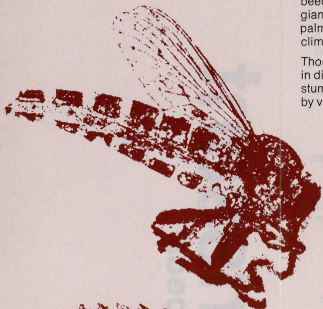
Fossils, nature's vivid reminders of long-past life, take many forms. The insects and leaves found at Florissant are carbon remains of the originals.

Though the fossil impressions can be seen only in displays at the visitor center, giant petrified tree stumps have been excavated and can be viewed by visitors touring the park.