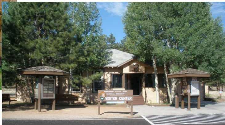
Left: The old Baker museum turned into a NPS visitor center that lasted until 2013.