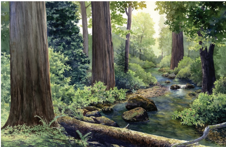
Artistic reconstruction of the Eocene forest at Florissant.

Heavy rain or rapid snowmelt can sweep rock and ash from volcanos into thick mudflows called lahars. Lahars can rush downslope at up to 120 mi/hr (190 km/hr). One lahar from the ancient Guffey Volcano flowed through the Florissant stream valleys 34 million years ago. This volcanic mudflow buried the forest there under more than 16 ft (5 m) of debris and killed the trees by preventing oxygen from reaching their roots. The lahar encased and protected the lower trunks, which are preserved as fossils. The roots and tops of the trees decayed or broke off.