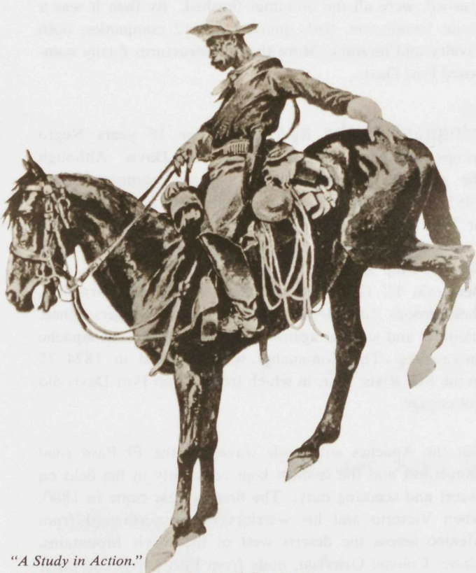
"A Study in Action." Negro soldier sketched by Frederick Remington.

fort davis today : Fort Davis National Historic Site was authorized as a unit of the National Park System in 1961. A program was immediately launched to save the remaining buildings and interpret the fort. Of more than 50 buildings that constituted Fort Davis when it was abandoned, visitors can view 16 residences on offices' row, two sets of troop barracks, warehouses, and the hospital. Sites of the remaining buildings, marked in most instances by stone foundations, can also be viewed. Recent archeological investigations have uncovered foundations of many buildings of the first fort.