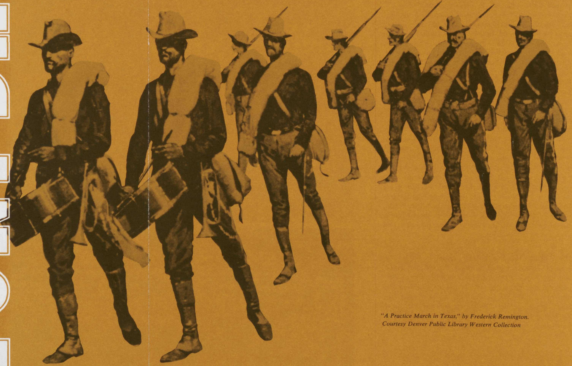
"A Practice March in Texas," by Frederick Remington.

fort davis national historic site, texas Key post in the defense system of West Texas, Fort Davis played a major role in the history of the southwestern frontier. From 1854 to 1891, troops based at the post guarded immigrants, freighters, and stagecoaches on the San Antonio-El Paso road and contended with the hostile Comanche and Apache Indians whose plunder trails scarred the deserts east and west of the fort. Today, the remains of Fort Davis are more extensive and impressive than those of any other southwestern fort. They are a vivid reminder of a significant chapter in the history of the western frontier.