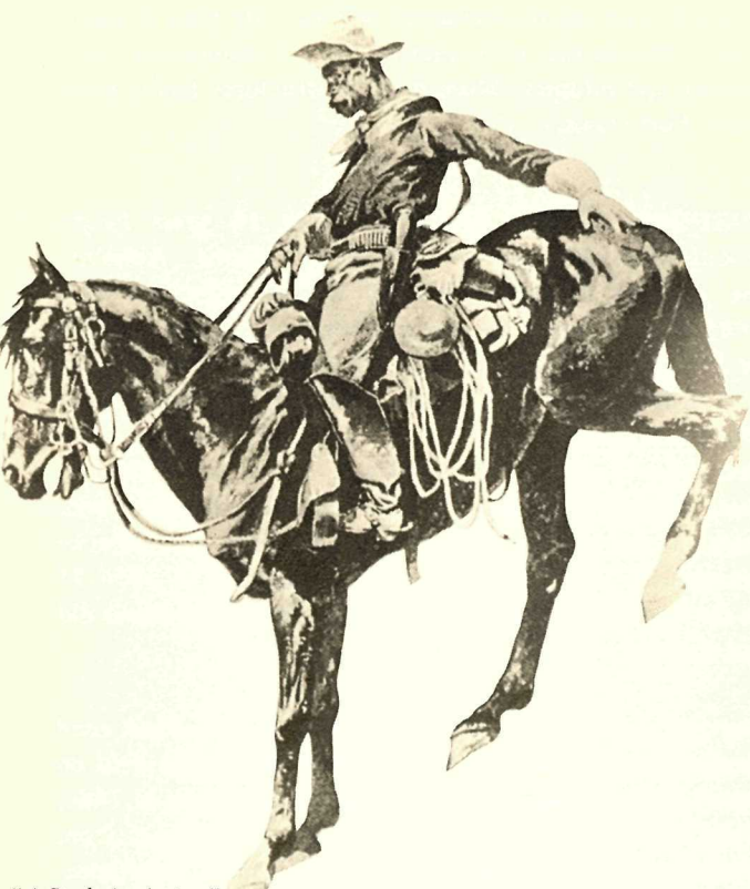
"A Study in Action." Negro soldier sketched by Frederick Remington.