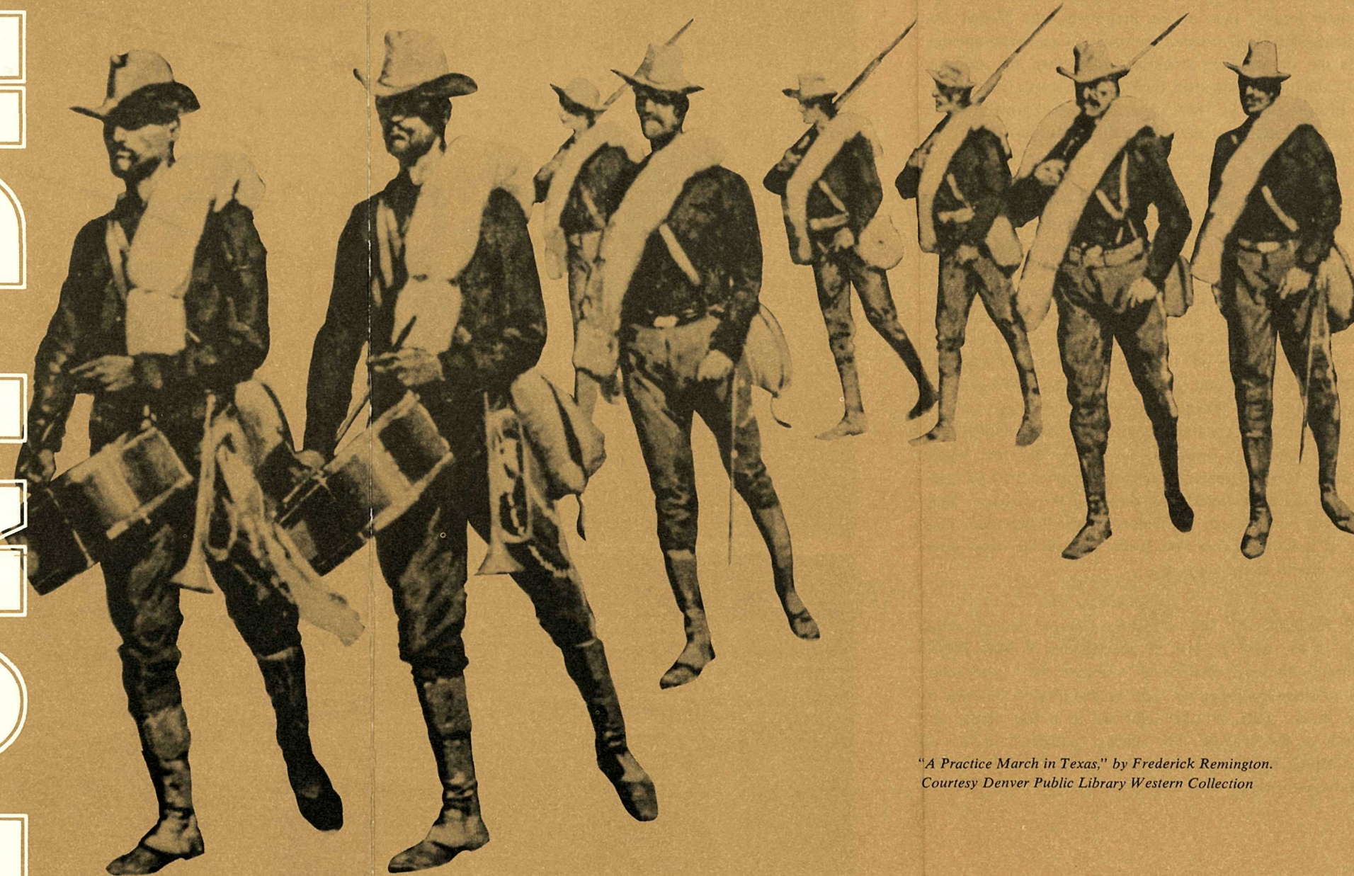
"A Practice March in Texas," by Frederick Remington.

the founding of fort davis : The Mexican War of 1846-48 added to the United States a vast territory comprising the present States of New Mexico, Arizona, and California. Texas had joined the Union on the eve of the war. Interest in the new lands quickened when word of the discovery of gold in California burst upon the Nation in 1849. Intent upon avoiding the winter snows and rugged mountains of the central routes to the gold fields, thousands of immigrants made their way over the southern transcontinental trails. A vital segment of the southern route was the newly opened San Antonio-El Paso road. Beginning in 1849, hundreds of immigrant and freight