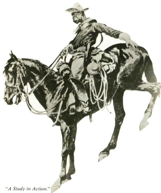
"A Study in Action." Negro soldier sketched by Frederick Remington.

fort davis today : Fort Davis National Historic Site was authorized as a unit of the National Park System in 1961. A program was immediately launched to save the remaining buildings and interpret the fort. Of more than 50 buildings that constituted Fort Davis when it was abandoned, visitors can view 16 residences on officers' row, two sets of troop barracks, warehouses, and the hospital. Sites of the remaining buildings, marked in most instances by stone foundations, can also be viewed. Recent archeological investigations have uncovered foundations of many buildings of the first fort.