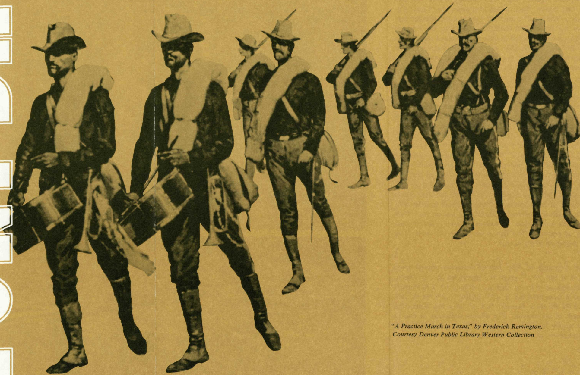
"A Practice March in Texas," by Frederick Remington.