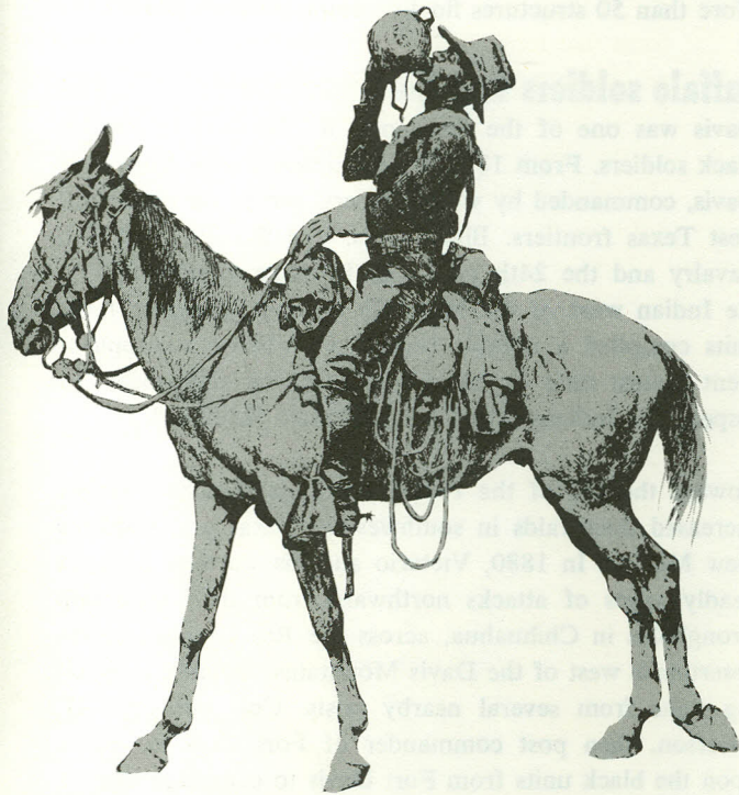
Negro soldier sketched by Frederick Remington.

Flipper, the first black graduate of West Point, arrived at the fort to serve as Acting Commissary of Subsistence. In the summer of 1881, however, Flipper was accused of embezzling government funds. After a controversial court-martial, the Army found Flipper innocent of the charges but guilty of unbecoming conduct and dismissed him from military service. A 94-year fight to clear his name ensued. Finally in 1976, at the urging of his descendents, the Army reviewed the court-martial transcripts and changed Flipper's discharge to honorable.