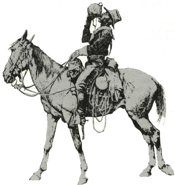
Negro soldier sketched by Frederick Remington.

Flipper, the first black graduate of West Point, arrived at the fort to serve as Acting Commissary of Subsistence. In the summer of 1881, however, Flipper was accused of embezzling government funds. After a controversial court-martial, the Army found Flipper innocent of the charges but guilty of unbecoming conduct and dismissed him from military service. A 94-year fight to clear his name ensued. Finally in 1976, at the urging of his descendents, the Army reviewed the court-martial transcripts and changed Flipper's discharge to honorable.