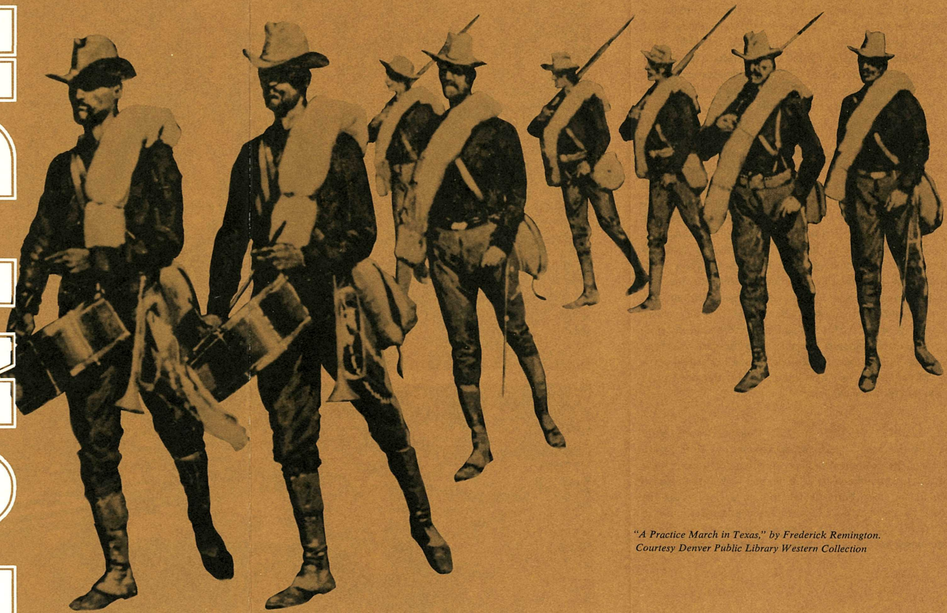
"A Practice March in Texas," by Frederick Remington.

the founding of fort davis : The Mexican War of 1846-48 added to the United States a vast territory comprising the present States of New Mexico, Arizona, and California. Texas had joined the Union on the eve of the war. Interest in the new lands quickened when word of the discovery of gold in California burst upon the Nation in 1849. Intent upon avoiding the winter snows and rugged mountains of the central routes to the gold fields, thousands of immigrants made their way over the southern transcontinental trails. A vital segment of the southern route was the newly opened San Antonio-El Paso road. Beginning in 1849, hundreds of immigrant and freight