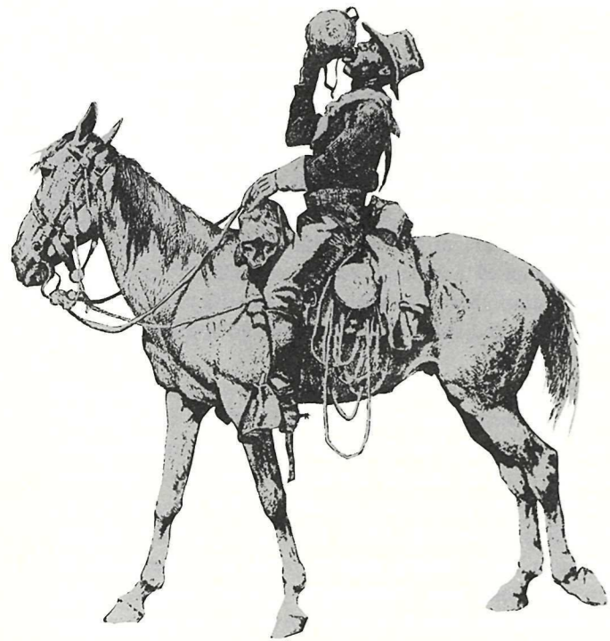
"Buffalo Soldier" sketched by Frederick Remington.

Flipper, the first black graduate of West Point, arrived at the fort to serve as Acting Commissary of Subsistence. In the summer of 1881, however, Flipper was accused of embezzling government funds. After a controversial court-martial, the Army found Flipper innocent of the charges but guilty of unbecoming conduct and dismissed him from military service. A 94-year fight to clear his name ensued. Finally in 1976, at the urging of his descendents, the Army reviewed the court-martial transcripts and changed Flipper's discharge to honorable.