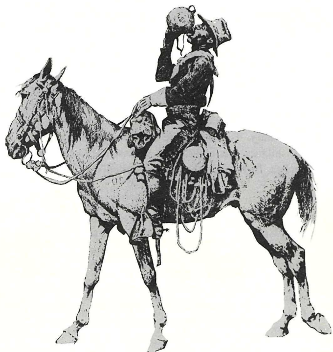
"Buffalo Soldier" sketched by Frederick Remington.

fort davis today: In 1961, the United States Congress authorized Fort Davis National Historic Site as a unit of the National Park Service. Through a continuing program of restoration, half of the more than 50 original structures have been saved. The visitor center and museum are open daily and audio programs, a slide show, and self-guiding tours of the grounds and several buildings are among the year-round services provided. A picnic grove and an extensive nature trail system are located at the site. Summer seasons are highlighted by costumed interpreters conducting tours and presenting demonstrations in the Commanding Officer's Quarters, Officer's Kitchen and Servant's Quarters, and an Enlisted Men's Barracks.