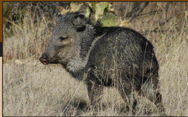
Javelina are a common sight in the Davis Mountains.

Davis Mountains State Park is a globally important birdwatching area and premier stargazing location. You can also enjoy hiking, mountain biking and day-use horseback-riding trails, camping and park ranger-led programs. McDonald Observatory and Fort Davis National Historic Site are nearby. We encourage you to tread lightly and help protect this unique and sensitive environment.