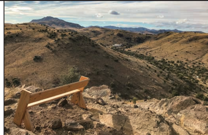
Keesey Canyon Overlook in Davis Mountains State Park

Cottonwoods and willows border Limpia Creek in the northern portion of the park. Large Emory oaks and gray oaks line its tributary, Keesey Creek, which runs through the campground. When flowing, both are precious water resources for wildlife.