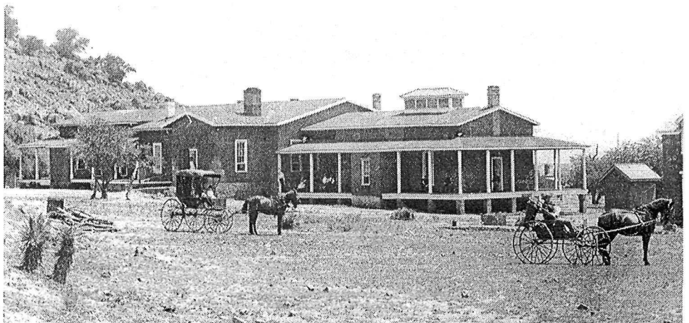
Late 1880s view showing back of post hospital