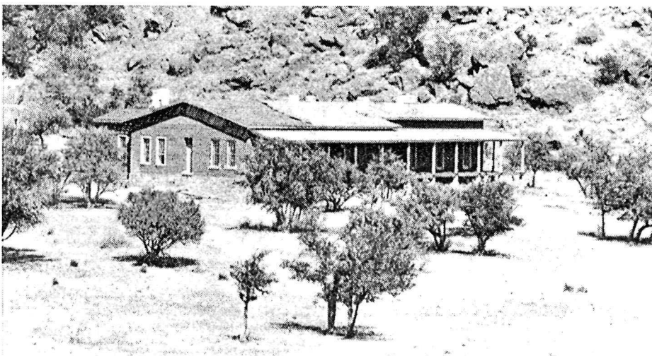
The hospital as it looked in the late 1870s. Another ward was added in 1884.

began in the mid-1870s, with the north ward and central administrative ward completed in 1876. In the summer of 1884 a south ward was added. The hospital consisted of two twelve-bed patient wards connected by a large administrative section. The latter contained the post surgeon's office, dispensary, kitchen, dining room, hospital steward's room, linen room, isolation ward, and storeroom.