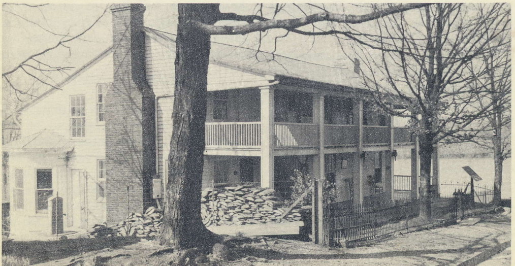
House in Dover, Tenn., in which Buckner surrendered to Grant.