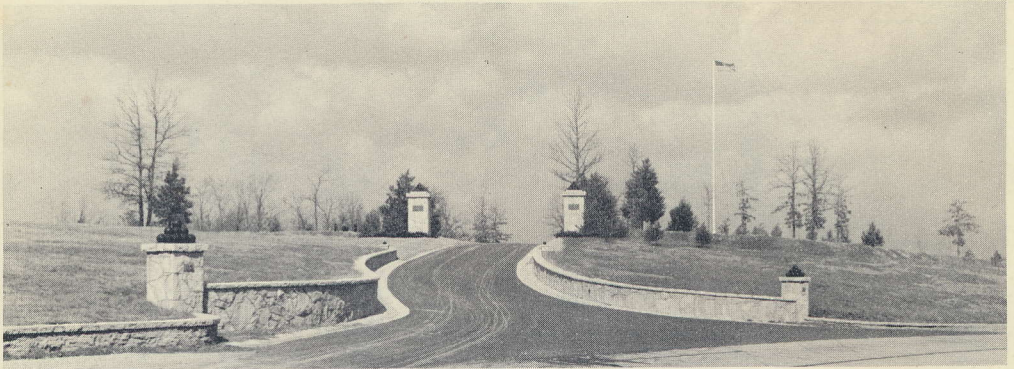
Entrance to Fort Donelson.

tory yet achieved by the North. It opened an avenue into the very heart of the Confederacy by way of the Tennessee and Cumberland Rivers, forcing the immediate evacuation of Columbus and Bowling Green, and delivering all of Kentucky and western Tennessee into Federal hands. The battle marked the beginning of a campaign which, after 17 months of bloody fighting, resulted in the complete control of all strategic points in the Mississippi Valley, thus splitting the Confederacy.