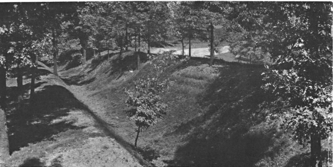
The Moat at Fort Donelson.

In his campaign against Fort Donelson, General Grant, for the first time in the war, made successful use of a river for large-scale operations. His attack, brilliantly conceived and unflinching executed upon this strong defensive position, resulted in the most important victory yet achieved by the North. It opened an avenue into the very heart of the Confederacy by way of the Tennessee and Cumberland Rivers, forcing the immediate evacuation of Columbus and Bowling