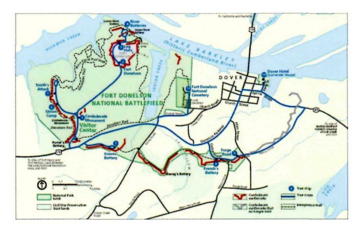
Map of Fort Donelson National Battlefield with auto tour stops

For More Information Fort Donelson National Battlefield P.O. Box 434 Dover, TN 37058