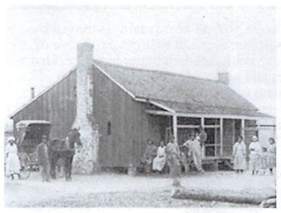
"The Great Migration"

In the first quarter of the 20th century, the Chicago Defender came to the forefront as the strongest proponent of "The Great Migration". The paper spoke of the hazards of remaining in the South and lauded life in the North. Job listings and train schedules were posted to facilitate the relocation. This movement brought more than 1.5 million rural Southern blacks to Northern industrial cities.