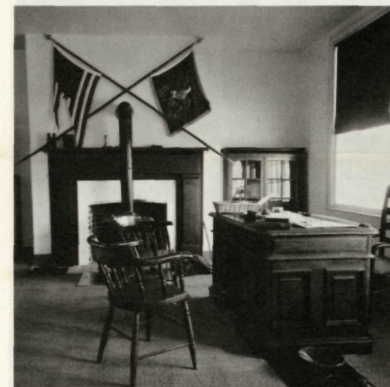
1864 POST COMMANDER'S OFFICE