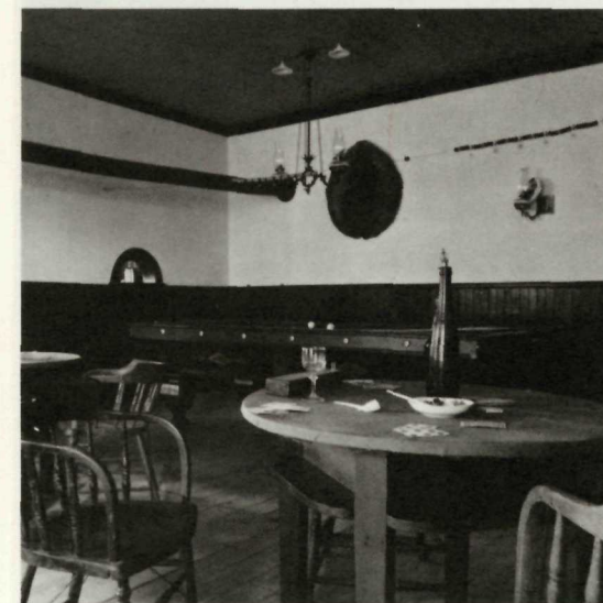
1883 OFFICER'S CLUB