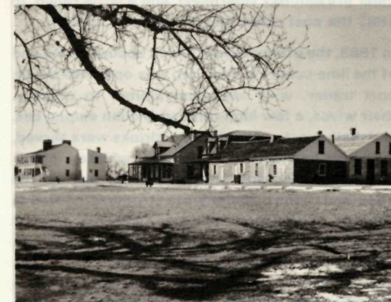
OFFICERS' QUARTERS AND SUTLER'S STORE