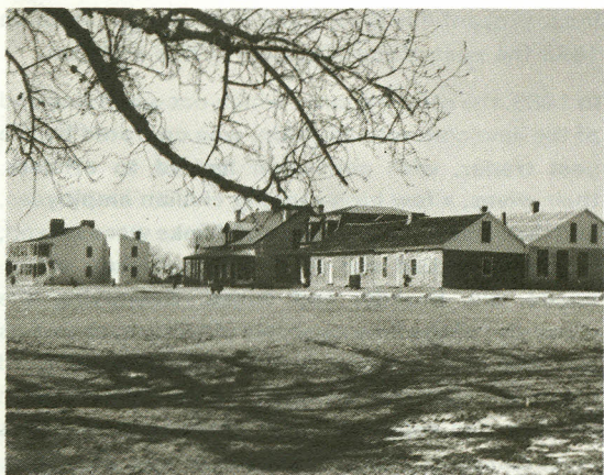
OFFICERS' QUARTERS AND SUTLER'S STORE