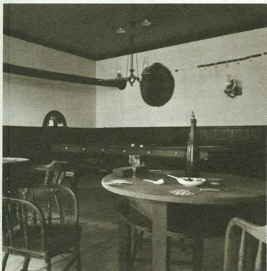
1883 OFFICER'S CLUB