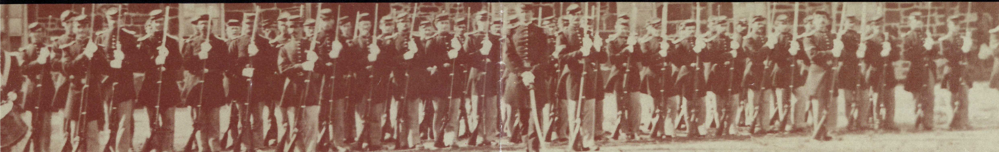
Company C, Third U.S. Infantry, in front of barracks at Fort Larned, 1867.

National Park Service U.S. Department of the Interior