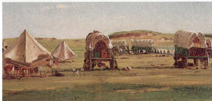
Encampment on the Plains, by Thomas Worthington Whittredge.

The vital artery of commerce, travel, and communication known to history as the Santa Fe Trail began on the west bank of the Missouri River, first at Franklin, then at Independence, later at Westport. It led west through Council Grove, past Fort Larned to Fort Dodge, where it forked, one route going southwest through the Cimarron Desert and the other continuing west into Colorado, turning south at Bent's Fort. Both branches merged just beyond Fort Union, 121 kilometers (75 miles) from Santa Fe. Fort Larned, like other outposts scattered along the trail, offered not only protection and refuge for harried travelers but also respite from the rigors of the journey and a chance to replace broken gear and dwindling supplies.