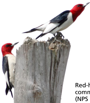
Red-headed Woodpeckers are common in Fort Larned NHS.