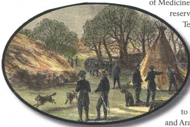
Burning the Cheyenne-Sioux Indian Village. Drawing from 1867 Harper's Weekly .