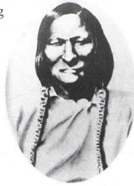
Black Kettle, whose clan was one of several at Sand Creek when the soldiers attacked.

The slaughter of peaceful Cheyenne and Arapaho at Sand Creek led to more fighting on the plains, prompting Congress to demand peace negotiations.