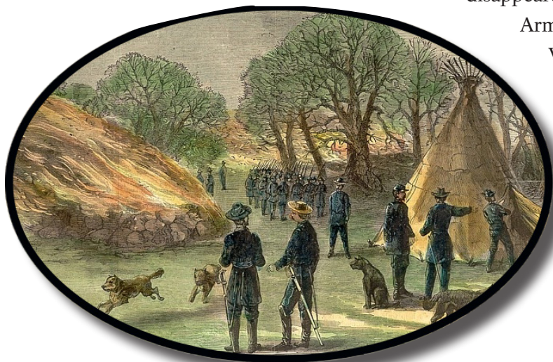
Burning the Cheyenne-Sioux Indian Village. Drawing from 1867 Harper’s Weekly .

The resulting Treaty of Medicine Lodge established reservations in the Indian Territory. Many Cheyenne, still refusing to give up their home along the Smoky Hill River, refused to sign the treaty. To get their signatures, commissioners agreed to allow the Cheyenne and Arapaho to remain until the buffalo herds disappeared. However, after attacks on white settlements, the Army began a campaign against all the Southern tribes.