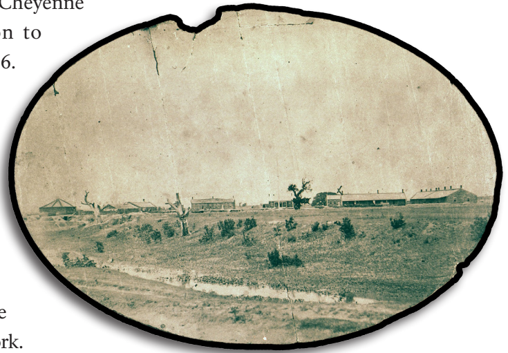
Photograph of Fort Larned taken in 1867.