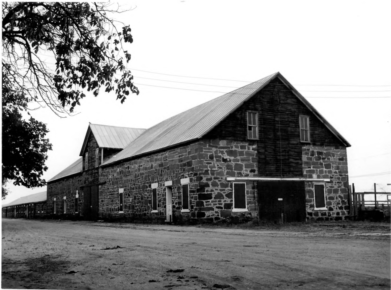
BARN at FORT LARNED. This structure has been converted from the old commissary storehouse at the post.