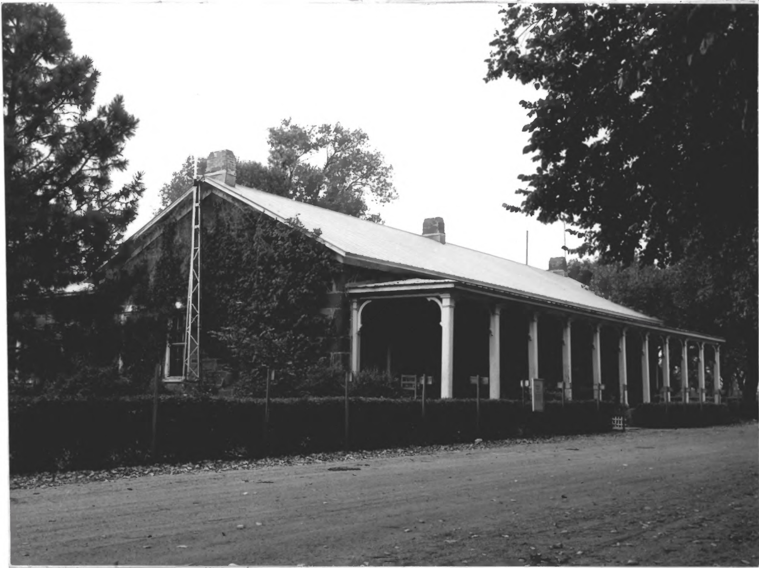
OFFICERS' QUARTERS FORT LARNED. This structure now serves as a museum