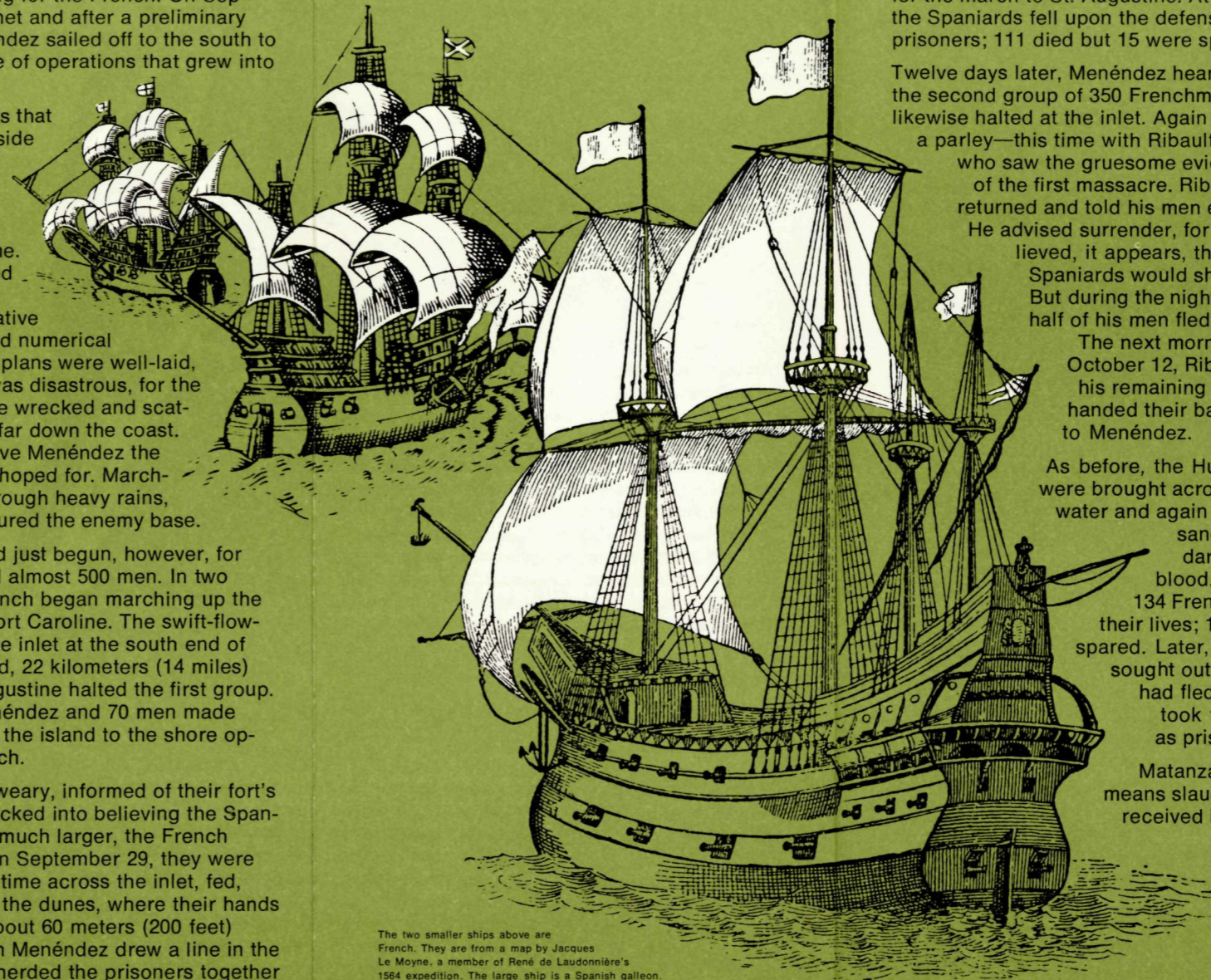
The two smaller ships above are French. They are from a map by Jacques Le Moyne, a member of René de Laudonnière's 1564 expedition. The large ship is a Spanish galleon. (Illustrations used by permission of the Viking Press.)

Famished and weary, informed of their fort's capture, and tricked into believing the Spanish force to be much larger, the French surrendered. On September 29, they were ferried ten at a time across the inlet, fed, and led behind the dunes, where their hands were bound. About 60 meters (200 feet) down the beach Menéndez drew a line in the sand and then herded the prisoners together