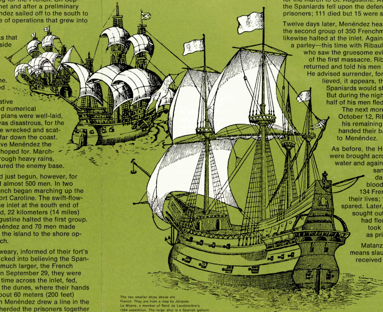
The two smaller ships above are French. They are from a map by Jacques Le Moyne, a member of René de Laudonnière's 1564 expedition. The large ship is a Spanish galleon.

Famished and weary, informed of their fort's capture, and tricked into believing the Spanish force to be much larger, the French surrendered. On September 29, they were ferried ten at a time across the inlet, fed, and led behind the dunes, where their hands were bound. About 60 meters (200 feet) down the beach Menéndez drew a line in the sand and then herded the prisoners together