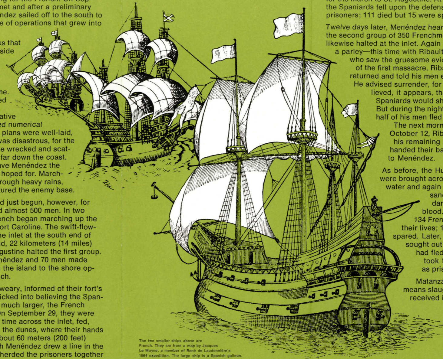
The two smaller ships above are French. They are from a map by Jacques Le Moyne, a member of René de Laudonnière's 1564 expedition. The large ship is a Spanish galleon.

Famished and weary, informed of their fort's capture, and tricked into believing the Spanish force to be much larger, the French surrendered. On September 29, they were ferried ten at a time across the inlet, fed, and led behind the dunes, where their hands were bound. About 60 meters (200 feet) down the beach Menéndez drew a line in the sand and then herded the prisoners together