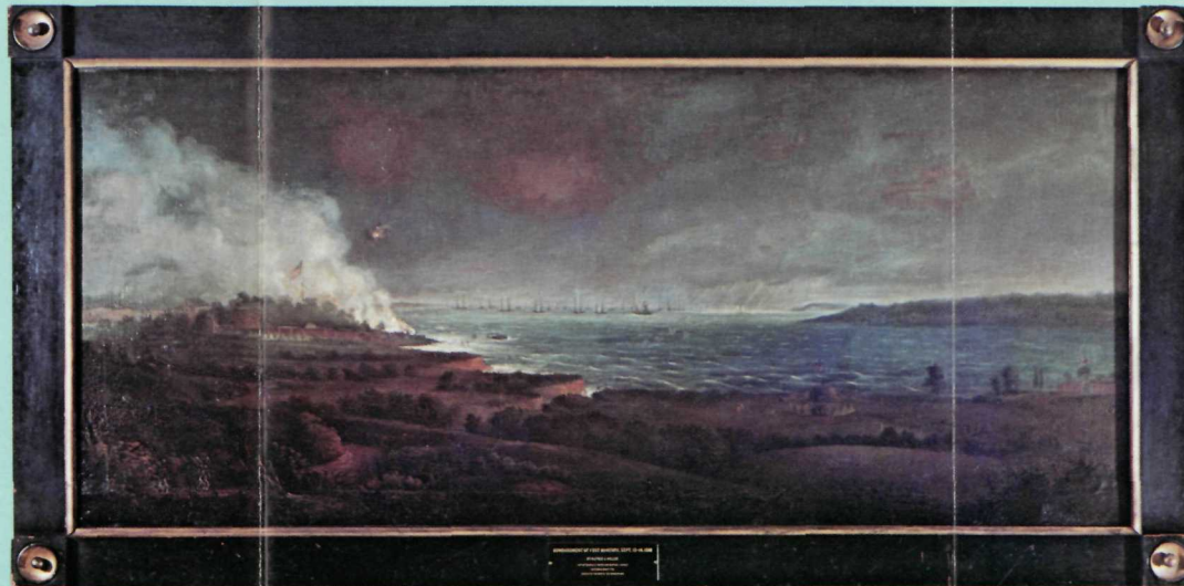
The Bombardment of Fort McHenry by Alfred Jacob Miller

Shortly before midnight all was ready. The rain made everyone miserable. Special care had to be taken to keep the powder from getting wet and making the guns useless. Sailors and marines from the fleet rowed up Ferry Branch toward Ridgely's Cove seeking their way around the batteries employed by the Americans to prevent such a foray. Meanwhile, the British soldiers facing Rogers Bastion had to contend with the mud as well as the rain and darkness.