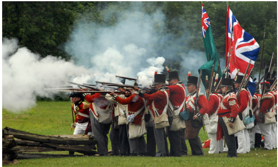
A British infantry line firing a volley in the PBS film "The War of 1812." You may view it also on line at PBS-Video. "A small but bitter war – that forged the destiny of a continent."

Proceeds from the premiere will benefit the 200 th Star-Spangled Banner Commission in Maryland. The film debut in Baltimore on October 10 th was well attended with Governor O'Malley, the staff of the 200 th Star-Spangled Commission and NPS staff in the audience.