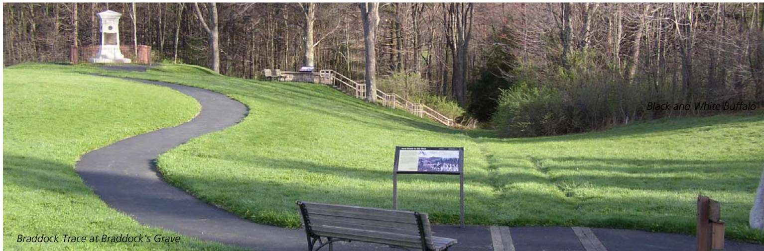
Black and White Buffalo