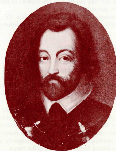
Sir Francis Drake

so great the Queen felt that no large ships could be spared for the relief of the colony. Two small pinnaces allowed to leave England never reached Roanoke.