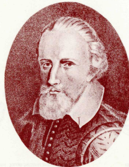
Sir Richard Grenville

Shortly afterward, Sir Richard Grenville arrived at Roanoke. He found the colony had gone. After searching for it elsewhere on the coast in vain, he left 15 men on Roanoke Island, with provisions for 2 years, to hold the country for Queen Elizabeth, and returned to England.